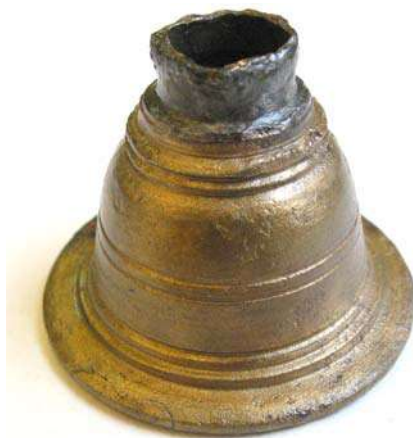
FIGURE 2. The mouthpiece fragment, exterior view 1.