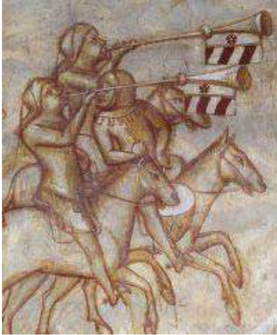
FIGURE 10. Lippo Vanni, The Battle of Val di Chiana (1363–73), detail. Palazzo Pubblico, Siena.