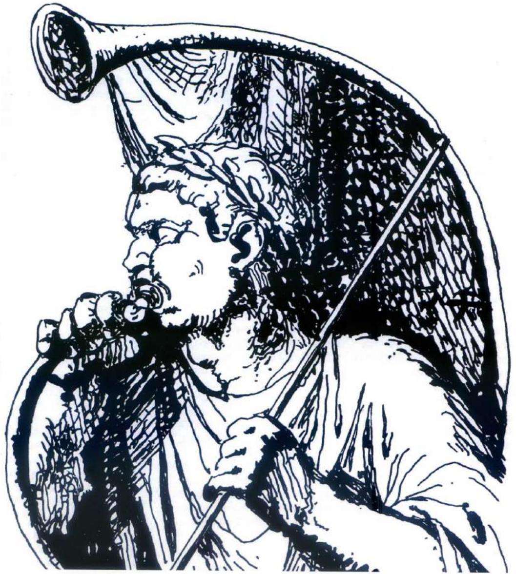
Bucinator on Trajan's Column, Rome

If this is truly a Historical Instruments column, it should incorporate your newest, shiny euphonium or tuba as well as serpents, bass horns, and ophicleides. That's quite simply because of the chronology. The tuba came into existence in 1835 in Berlin, and a few years later the euphonium appeared. To give these events some historical perspective, in 1835 elsewhere in Germany the country's first railroad opened; in the United