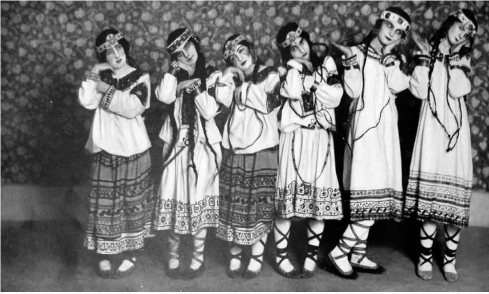
FIGURE 1 Les Adolescentes in Le Sacre du Printemps (Photo Gerschel, in: Le Théâtre , 1 July 1913, p. 20)