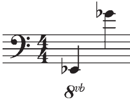
FIGURE 10 The tuba range in Le Sacre

Given the actual range of the tuba parts – from low E\flat^1 to G\flat^4 (the first starting on A^1 , see Figure 10) – the French speciality of the six-valve tuba (with Périnet valves) seems well suited to Le Sacre . It is relatively small – more the size of a euphonium today, which gives it a sound that blends somewhat better with the rest of the orchestra than that of the giant contrabass tuba – but is perfectly able to provide the whole range needed by the part in question.