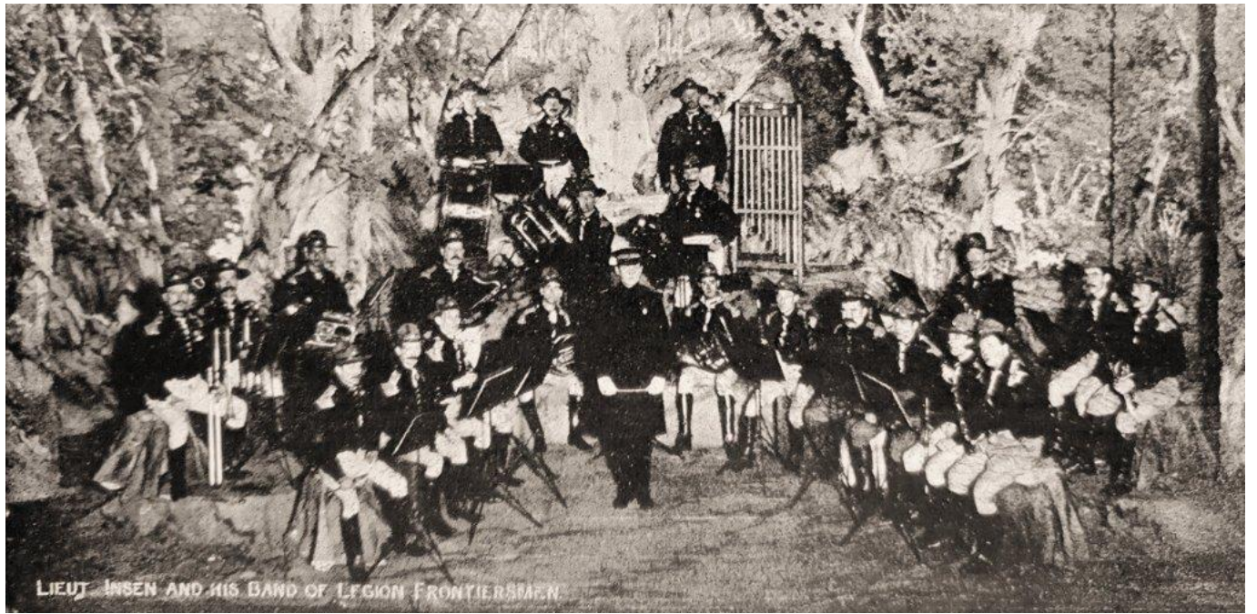
Canadian Legion of Frontiersmen Band, 1912