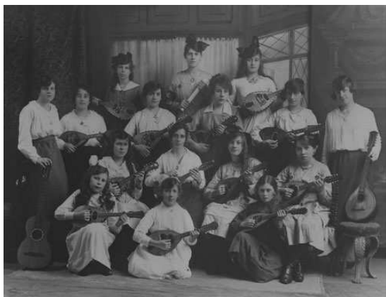
6 The Ladies' Mandolin and Guitar Band, Rushden, Northamptonshire (photograph taken before World War I)

guitars are capable of arpeggio passages and detached chords ... but the difference between the upper and the lower three strings has to be noticed when melodic passages are given to the guitar. 35