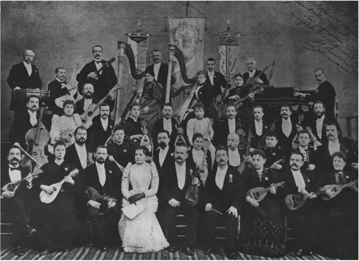
1 The 'Reale circolo mandolinistico Regina Margherita', 1892

harps, augmented for the competition by timpani, cello and piano. 4