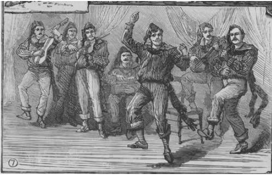
2 The Neapolitan Mandoline Concert at the 1888 Italian Exhibition, Earl's Court

encouraged to acquire a competence in music (usually piano and singing), but this was primarily to improve their chances in the marriage market, and their skills were intended only for domestic display (or perhaps as one of the accomplishments necessary for a career as a governess), not for the public stage, which would entail the impropriety of subjecting themselves to the male gaze. They might entertain family and guests at home, or occasionally sing in an oratorio or in church, but appearing in a theatre or a concert hall (especially for money) would have compromised their respectable status, and was something best left to 'foreign' women. It is no coincidence that the female instrumental soloists who were best known to London audiences—such as the pianist Clara Schumann, the violinist Wilma Neruda and the guitarist Madame Sidney Pratten ( née Catherina Pelzer)—invariably came from overseas.