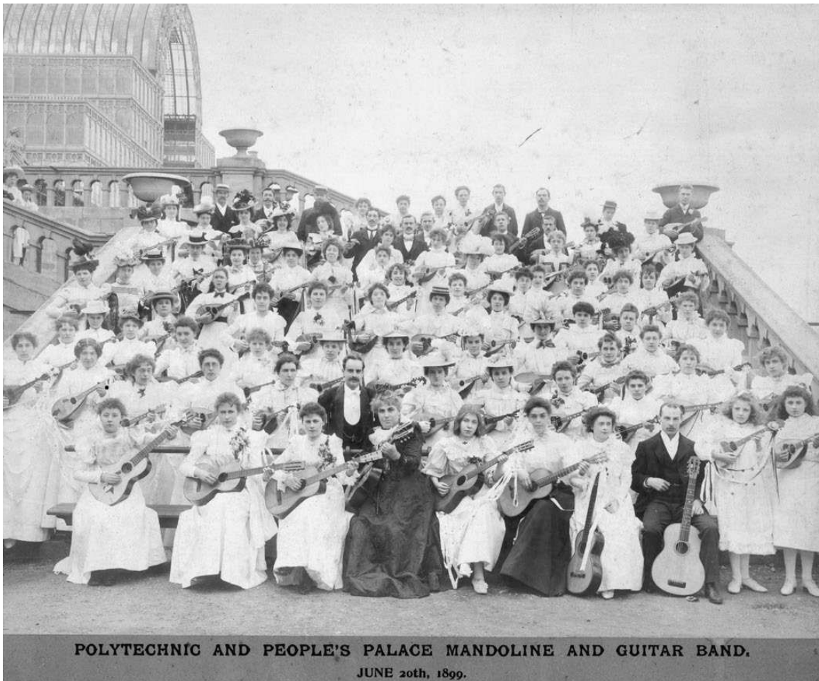
7 The Polytechnic Mandoline and Guitar Band, pictured outside the Crystal Palace, Sydenham Hill, South London in 1899

Mixed-gender mandolin and guitar bands continue to the present day, as do BMG orchestras (banjos, mandolins and guitars); however, fashionable society's fascination with ladies' mandolin and guitar bands had largely run its course in Britain before World War I. During the Edwardian era, as the political movement for female equality gained momentum, respectable women no longer felt the need to justify their desire to perform music in public, as had been the case 20 years earlier; and furthermore it had now become socially