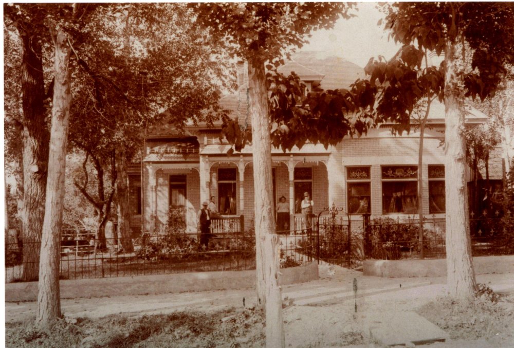
William Pitt homes located at North Temple and 100 West in Salt Lake City, Utah. Original adobe home (top) and later home (bottom).