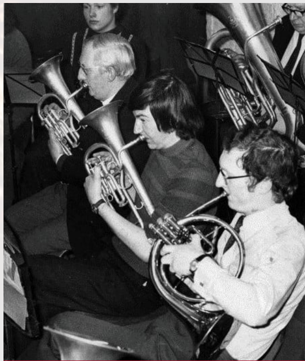
Besses o' th' Barn Band's horn section, including one tenor cor.

tenor cor to replace the traditional Eb horn and the Eb trumpet instead of the soprano cornet. Another innovation was a completely new seating arrangement, whereby he positioned many of the players on the opposite side of the platform to that which they formerly occupied.