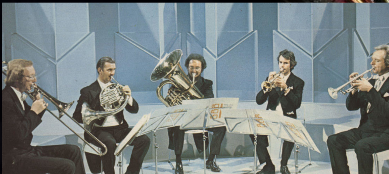
I for, second from left, pictured while performing with the legendary Philip Jones Brass Ensemble, which set new standards for chamber brass playing.