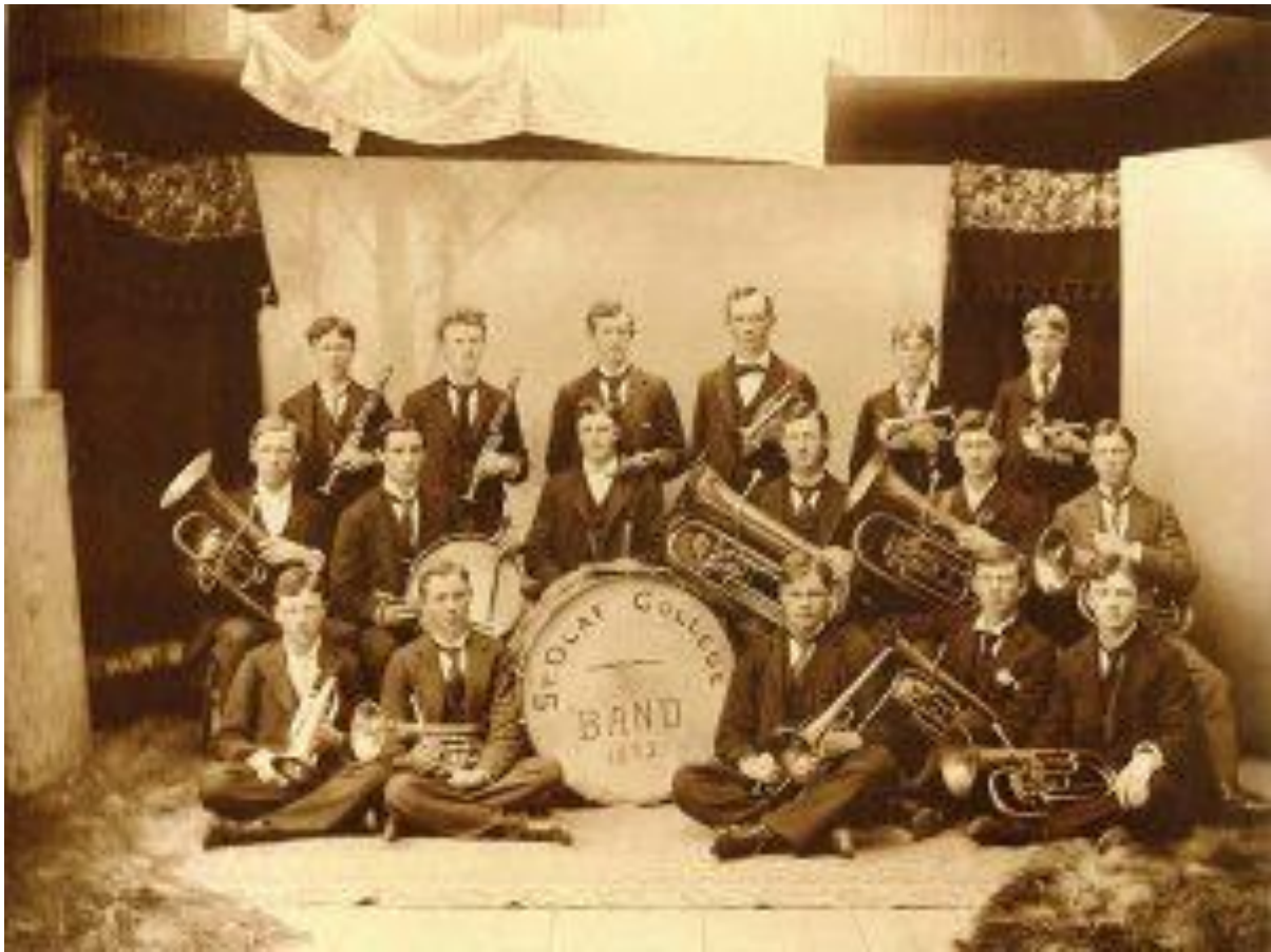
The St. Olaf College Band, shown here in 1895, was founded by students in the fall of 1891.