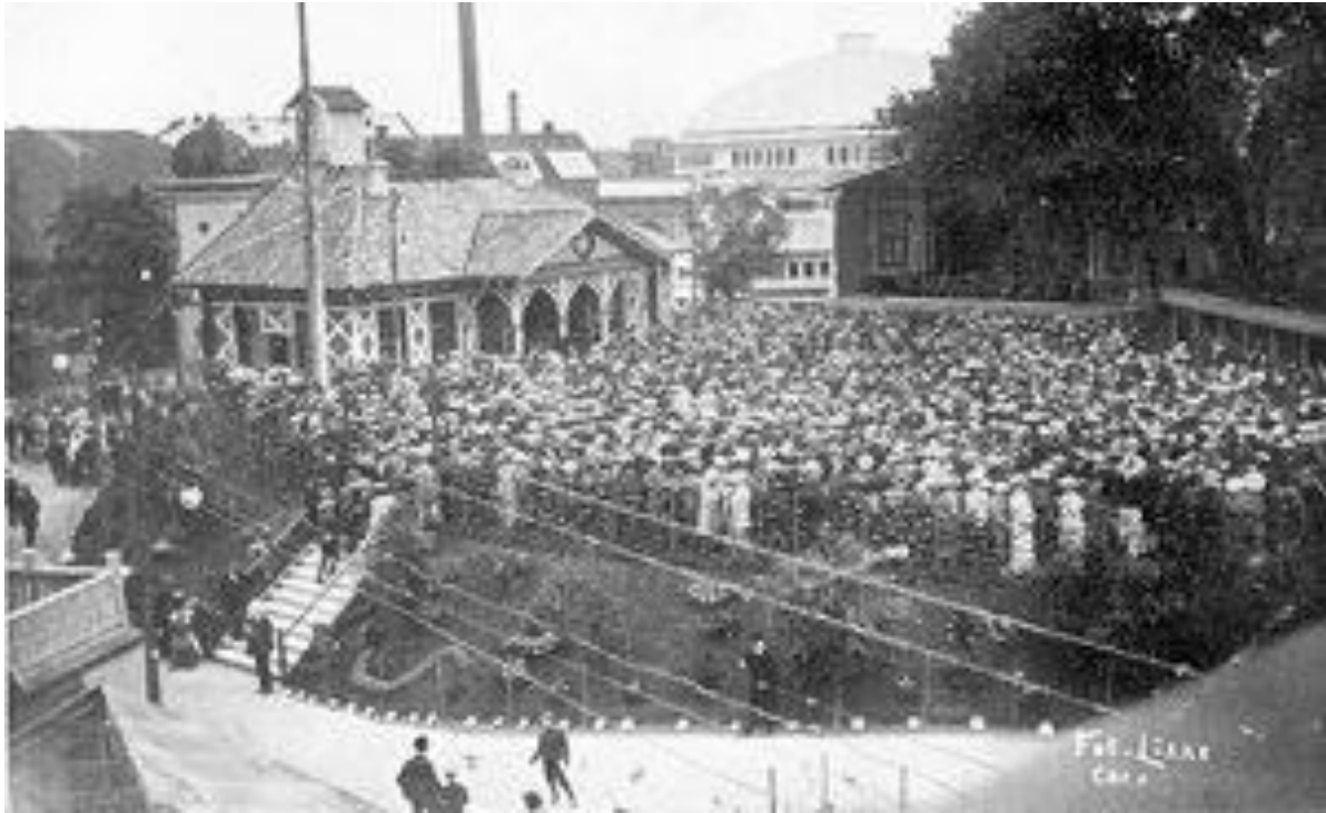
F. Melius Christiansen led the St. Olaf Band to Norway in 1906. It was the first U.S. college musical organization to tour in Europe. The first concert was in Tivoli Garden in Oslo before a crowd of 6,000.