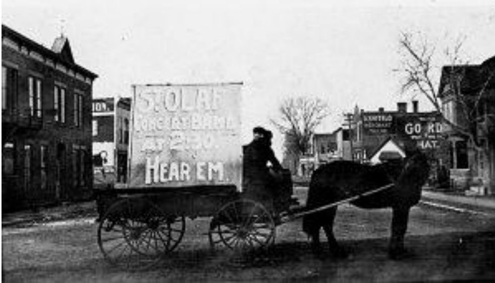
A horse and carriage brought word of the St. Olaf Band concert to Wells, Minn., in 1913.