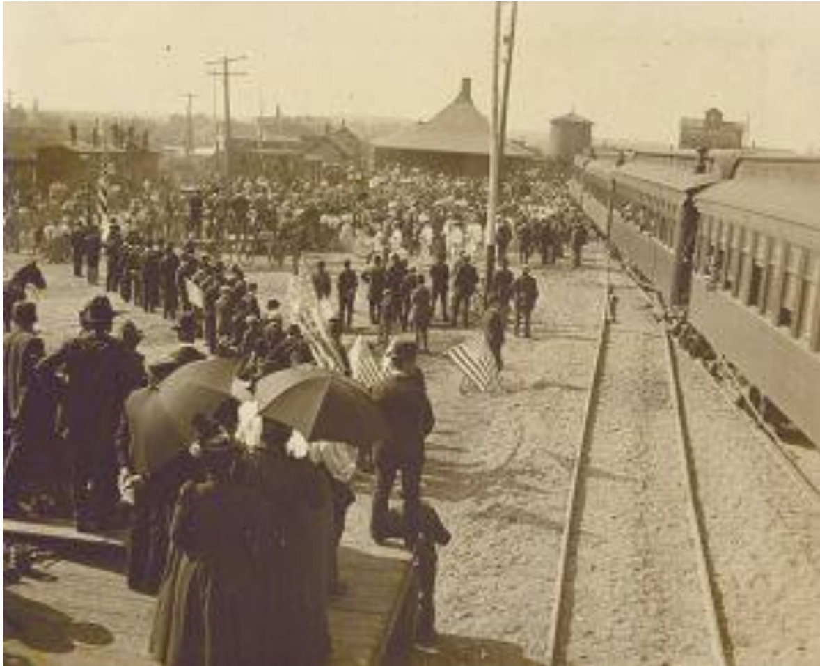
The St. Olaf Band (center, in white uniforms) played on April 29, 1898, as Northfield sent off recruits at the depot for the Spanish-American War.