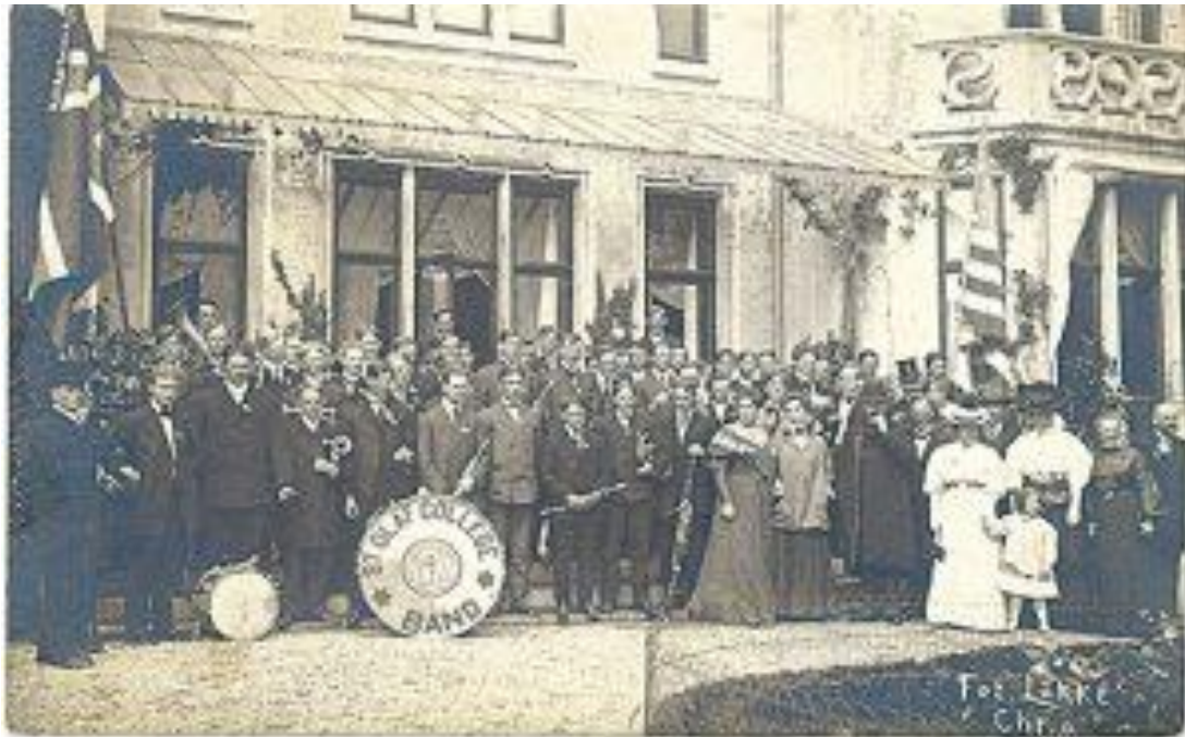
On the 1906 tour, the St. Olaf Band visited Norway's Prime Minister Michelsen at his estate near Bergen.