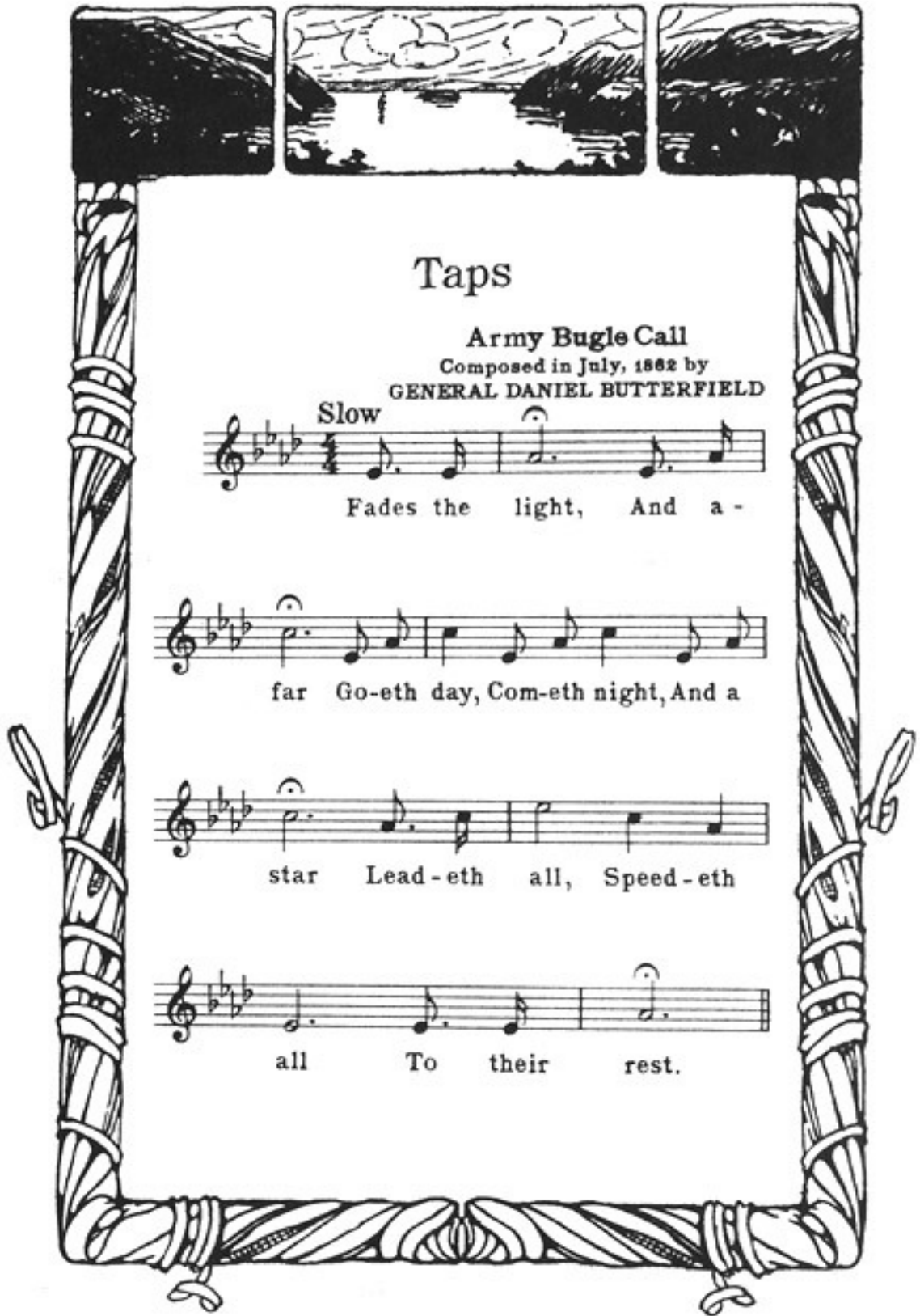
Figure 11. Taps from the West Point Songbook edited by F. C. Mayer