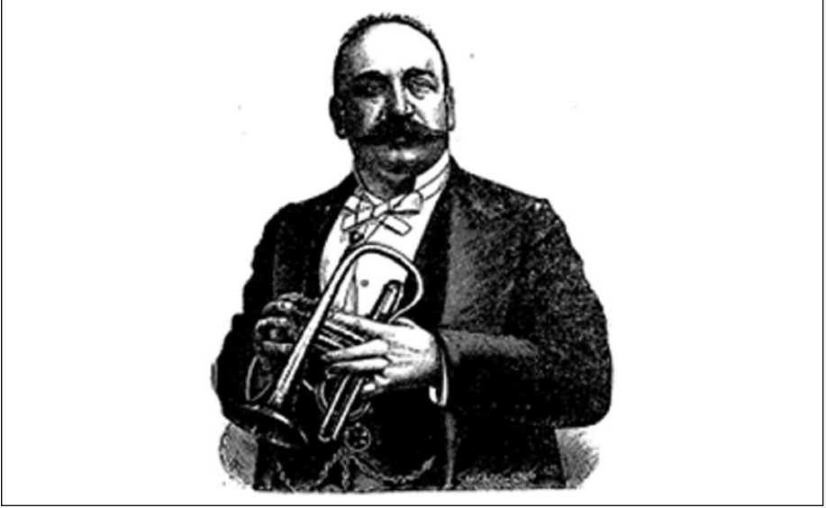
Figure 2. Jules Levy, c. 1896. 49

American citizen in 1893 and recorded a number of solos for the Victor and Columbia phonograph companies over the next decade. 47 C. G. Conn published Levy's Cornet Instruction Book in 1895, by which time he had publicly endorsed Conn instruments for several years. 48