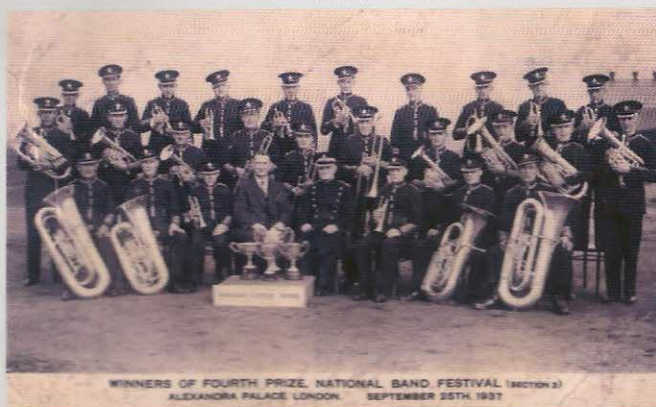
The Yorkshire Copper Works Band in 1937.

His tenure as MD lasted for four years, resulting in eleven top three placings at National contest level, including wins at the 1993 Yorkshire Regional Championships and Brass in Concert in 1995. Prior