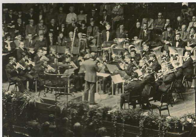
1978 - Yorkshire Imperial Metals Band winning the National Championships at the Royal Albert Hall, London.