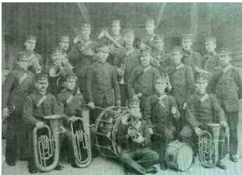
The Hanwell Band outside the Viaduct Inn, Hanwell, 1903.