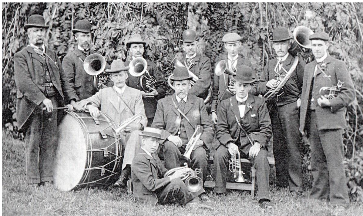
Morwenstow Band 1903 at Tonnacombe Manor