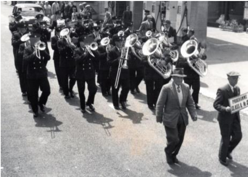
Newquay Town Band at Bugle or Stenalees Contest