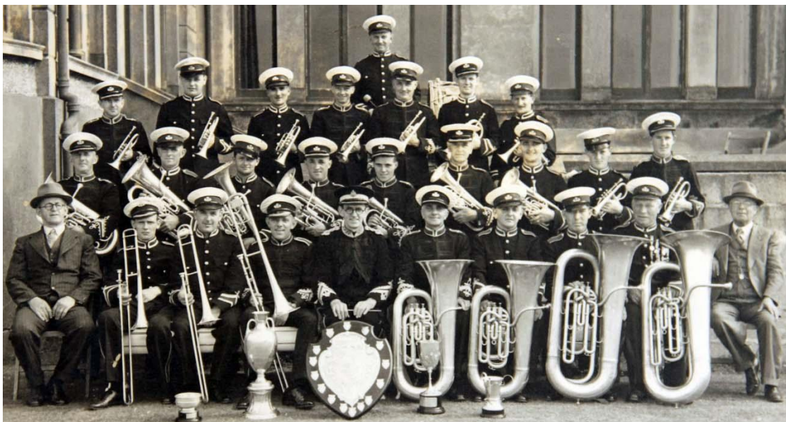
Newquay Town Band 1949