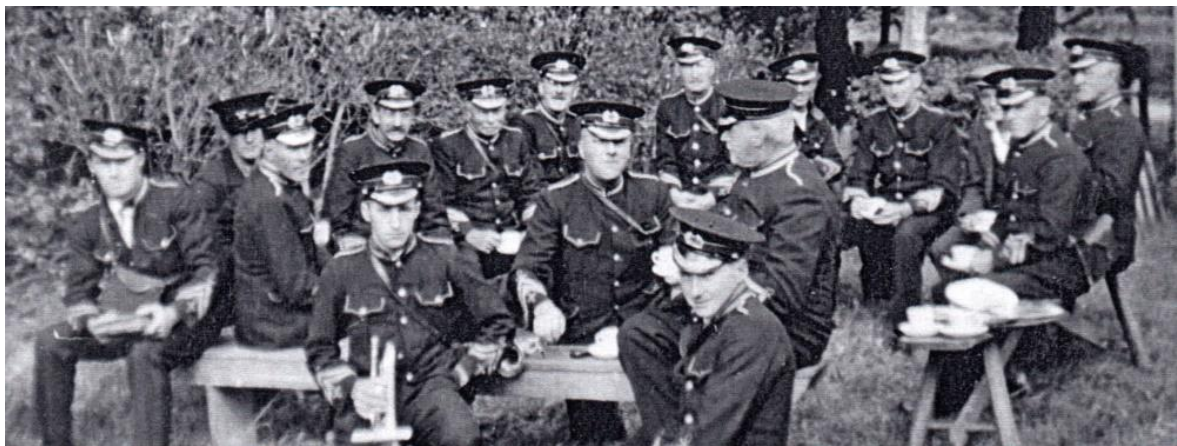
Morwenstow Band at Tonnacombe Fete 1935