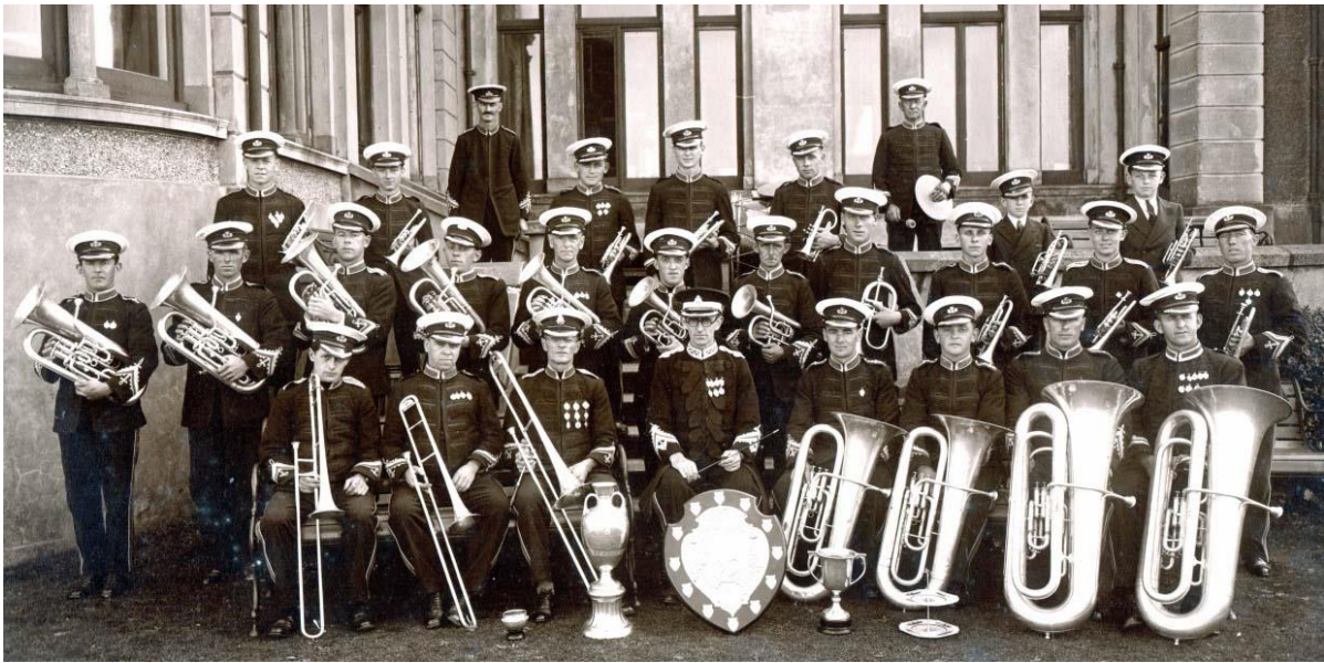
Newquay Town Silver Band 1934