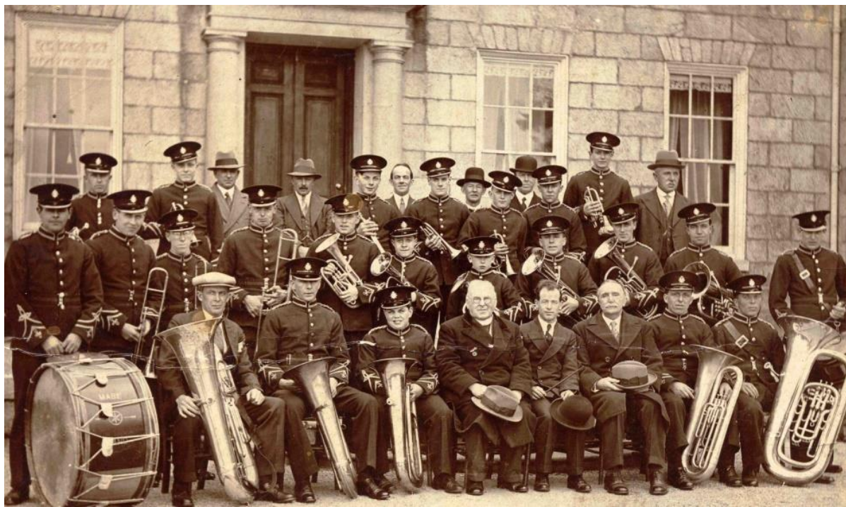
Mabe Burnthouse Band thought to be about 1933