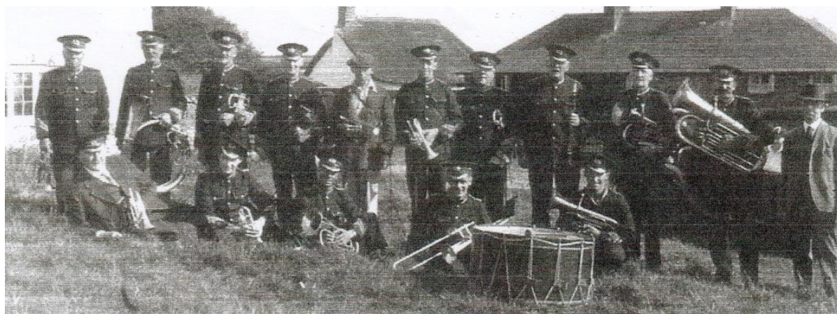
Morwenstow Band at Crosstown Green 1934