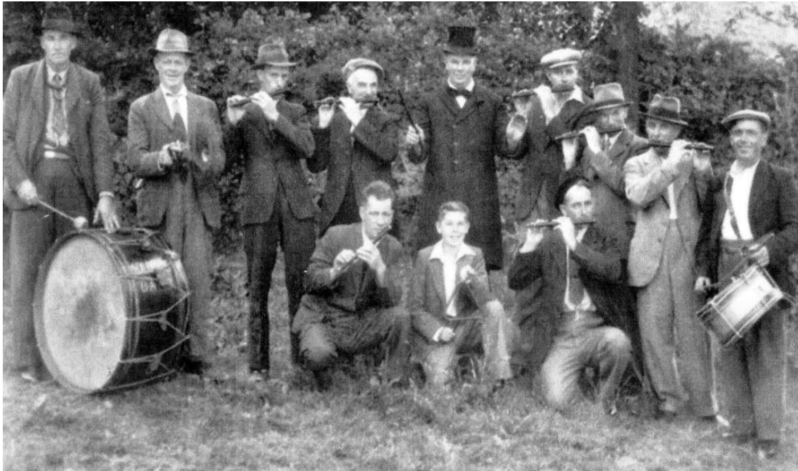
Molinnis Fife and Drum Band – date unknown

1875: "St Austell Wesleyan. There was a procession through the town of St Austell, headed by the Charlestown and Par Artillery Volunteer Bands and Amateur Bands from Tregony , Grampound , Mollinis , and St Dennis . The weather was not very favourable, but it ..." (7 August 1875 – Royal Cornwall Gazette)