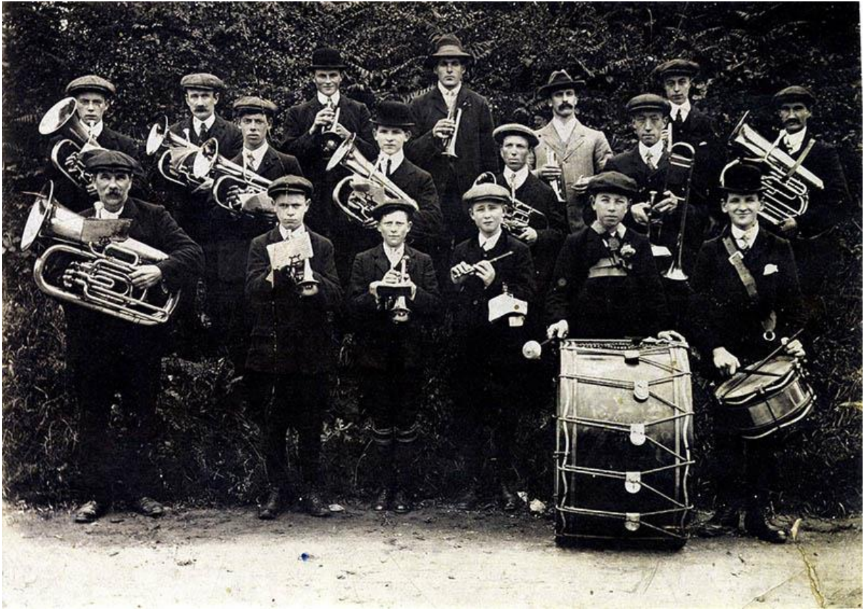
Merrymeet / Menheniot Band 1909

Merrymeet is a village in the parish of Menheniot in east Cornwall on the A390 main road Menheniot is a civil parish and village 2 ½ miles southeast of Liskeard