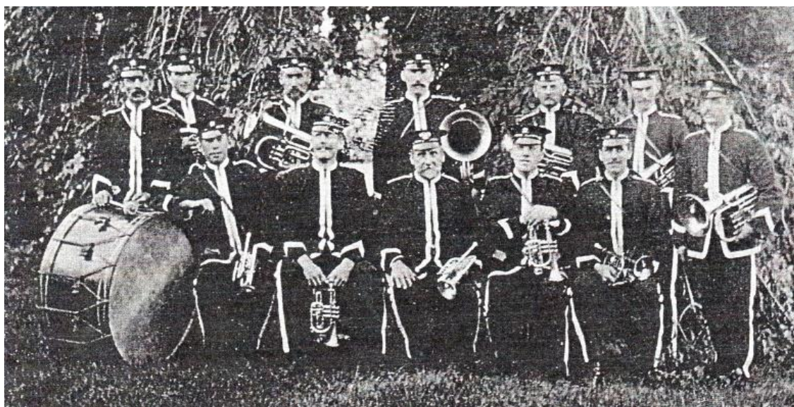
Morwenstow Band at Tonnacombe Manor Fete circa 1906