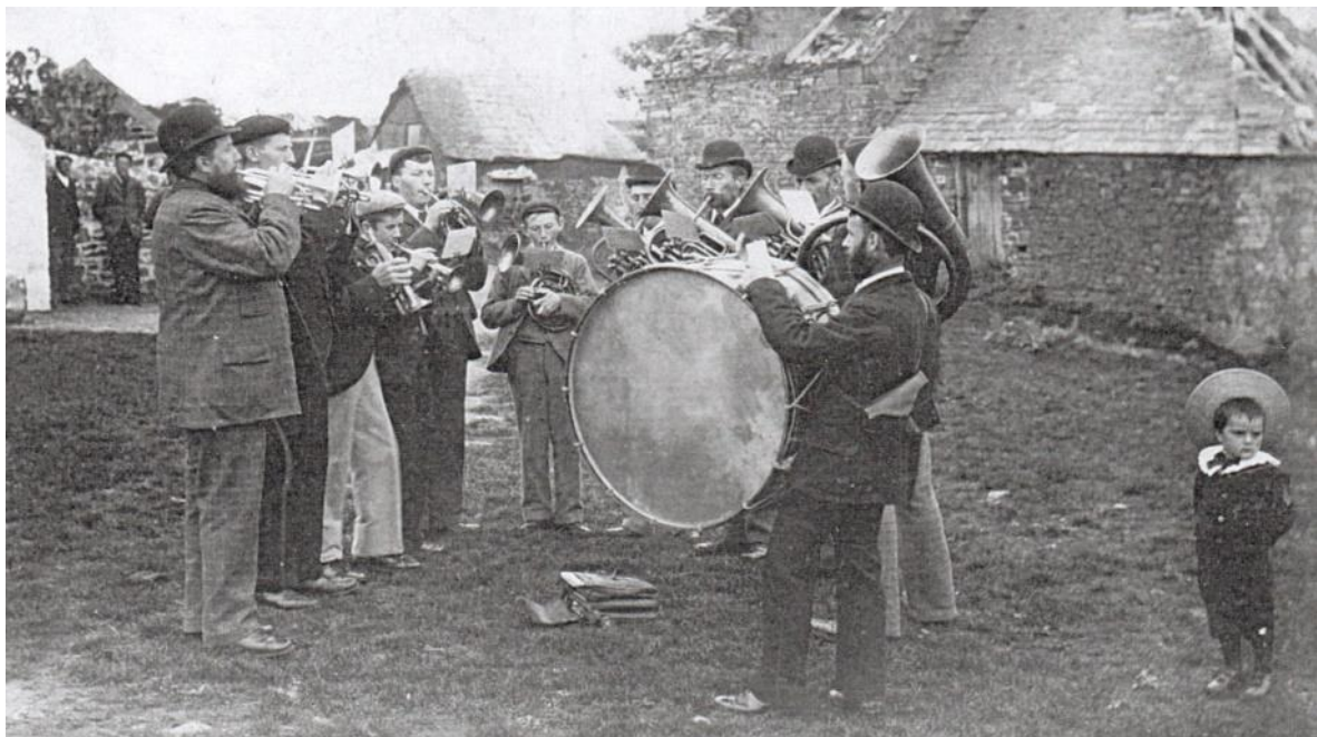
Morwenstow Band on Cross Town Green 1896