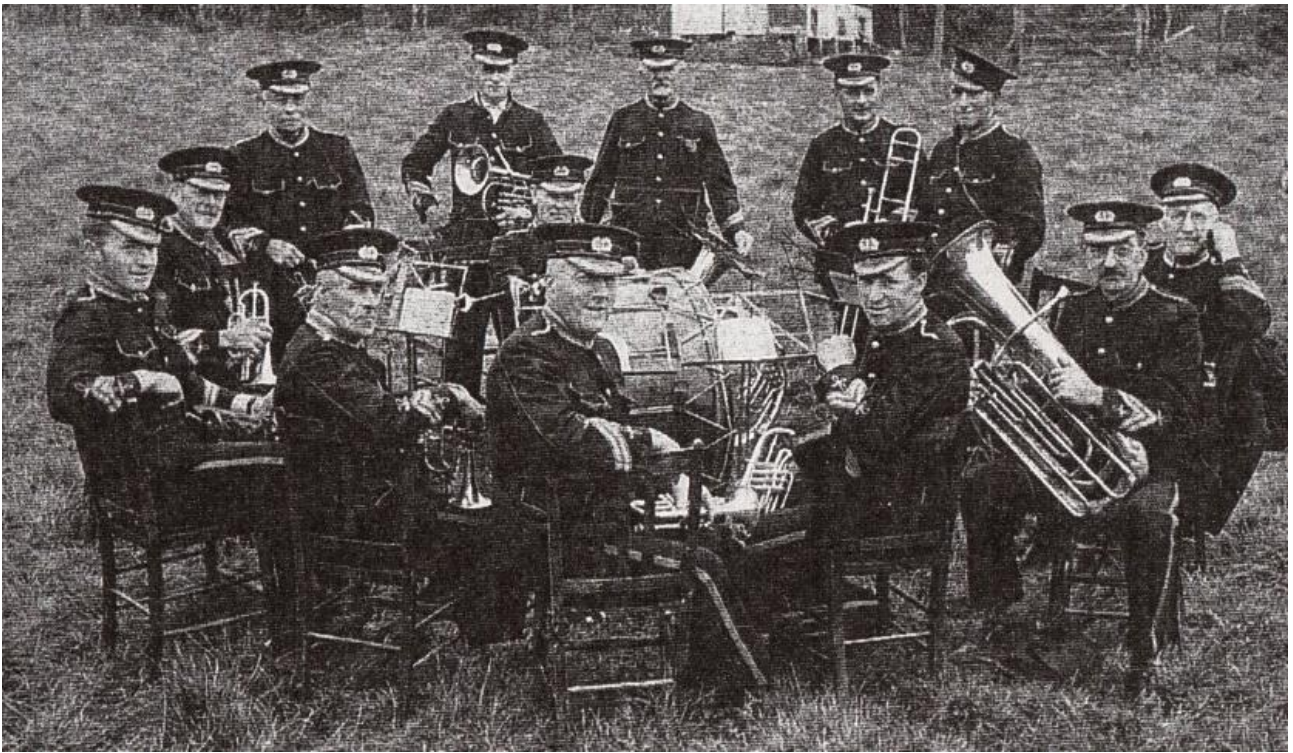
Morwenstow Band at Poughill Revel / Cuckoo Fair 1939