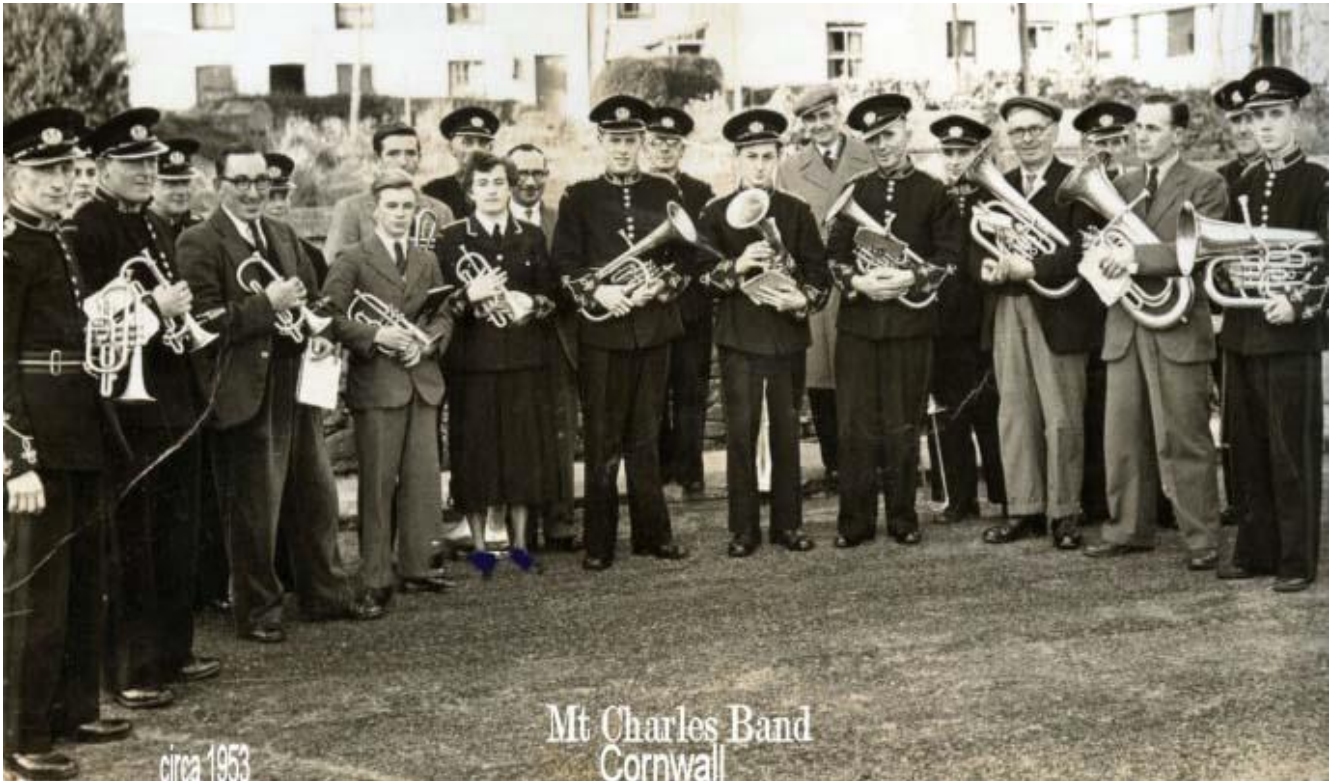
Mount Charles Band 1953