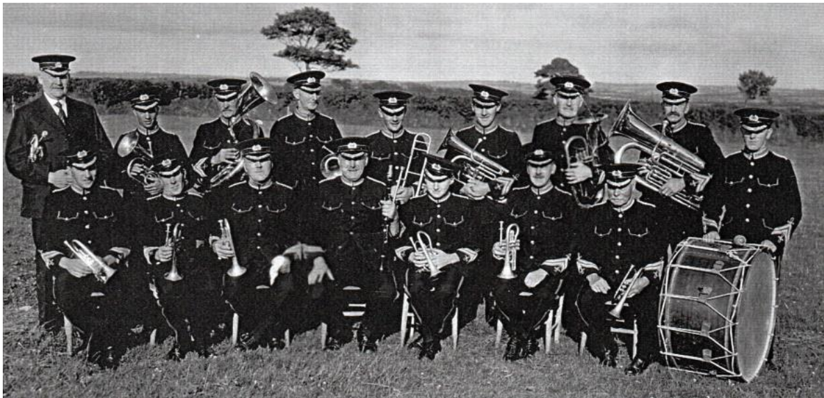
Morwenstow Band circa 1935