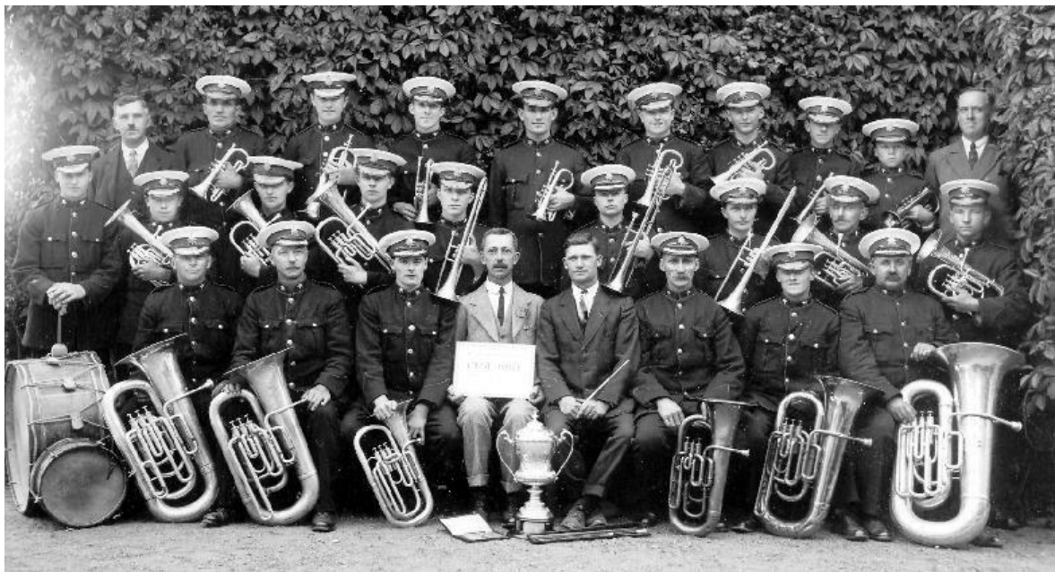
Liskeard Silver Band 1928

1930: "... engage professional bands, and not ... our combinations such as the Territorial , Salvation Army , City Transport , Liskeard and Torpoint Bands , with which ... dated last year. Disgusted!" (21 March 1930 – Western Times)