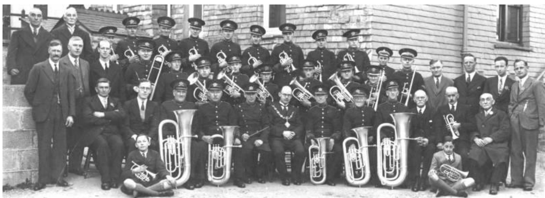
Liskeard Band 1939