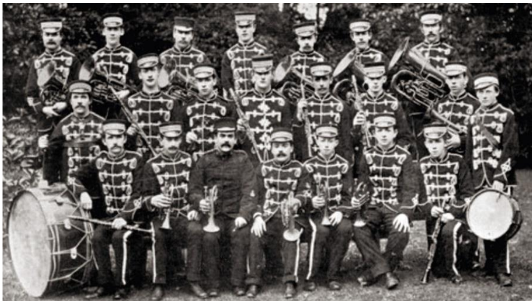
Liskeard Temperance Brass and Reed Band

1903: "... received from bands. The Liskeard Temperance Brass and Reed Band tendered £8 for the ..., and the Liskeard Volunteer Band £3. with a luncheon ticket for bandsman, to play in the procession, with £3 for evening concert. Members took exception ..." (21 May 1903 – West Briton and Cornwall Advertiser)