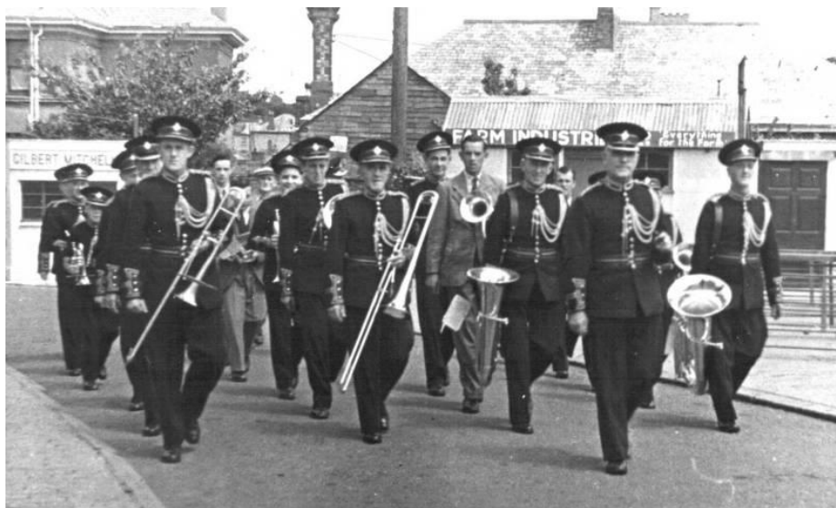
Liskeard Band in 1954

1950: "Burraton Community Association's second flower and produce show, fete, and carnival on Saturday. Sideshows, stalls, and Liskeard Silver Band had to be crowded into a marquee, and a display of miniature ..." (17 July 1950 – WMN)