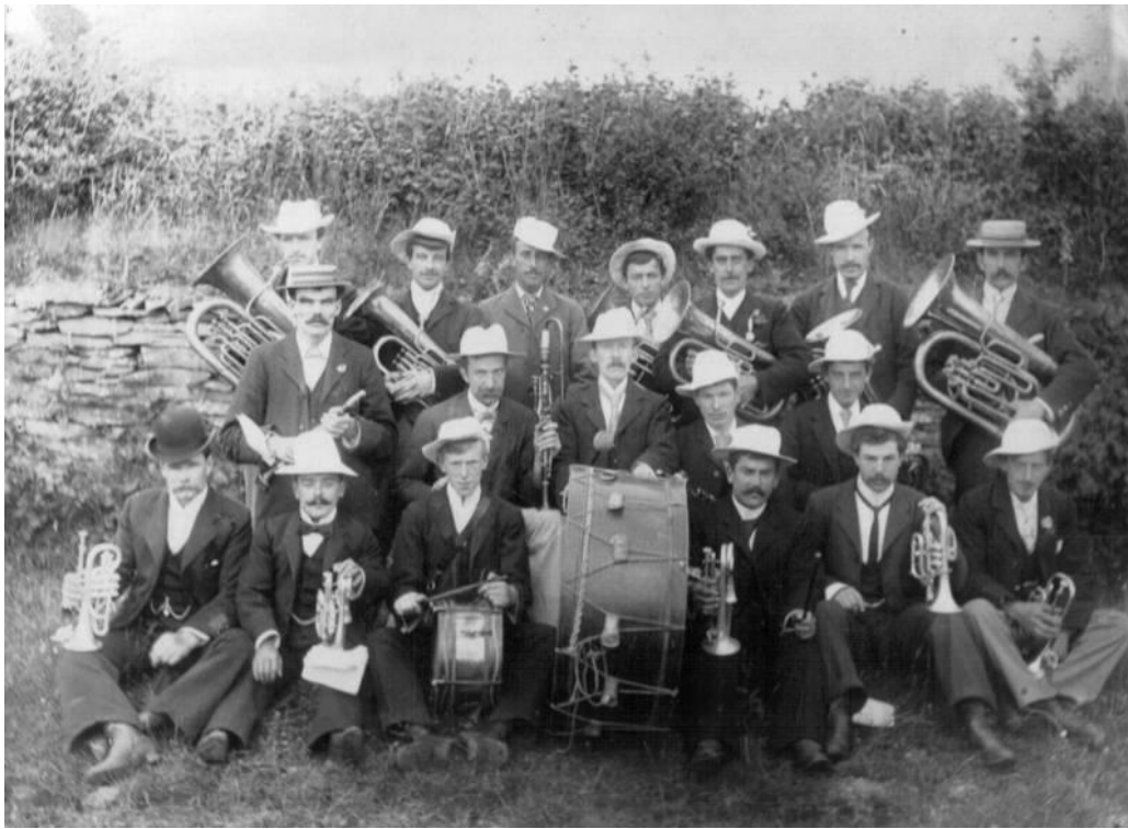
Liskeard Temperance Band circa 1901

1902: "... Bible Christians was held on Wednesday week. The children marched through the village, headed by the Liskeard Temperance Band . A tea In the field was well patronised, and the evening meeting in the chapel was crowded..." (4 September 1902 – Royal Cornwall Gazette)