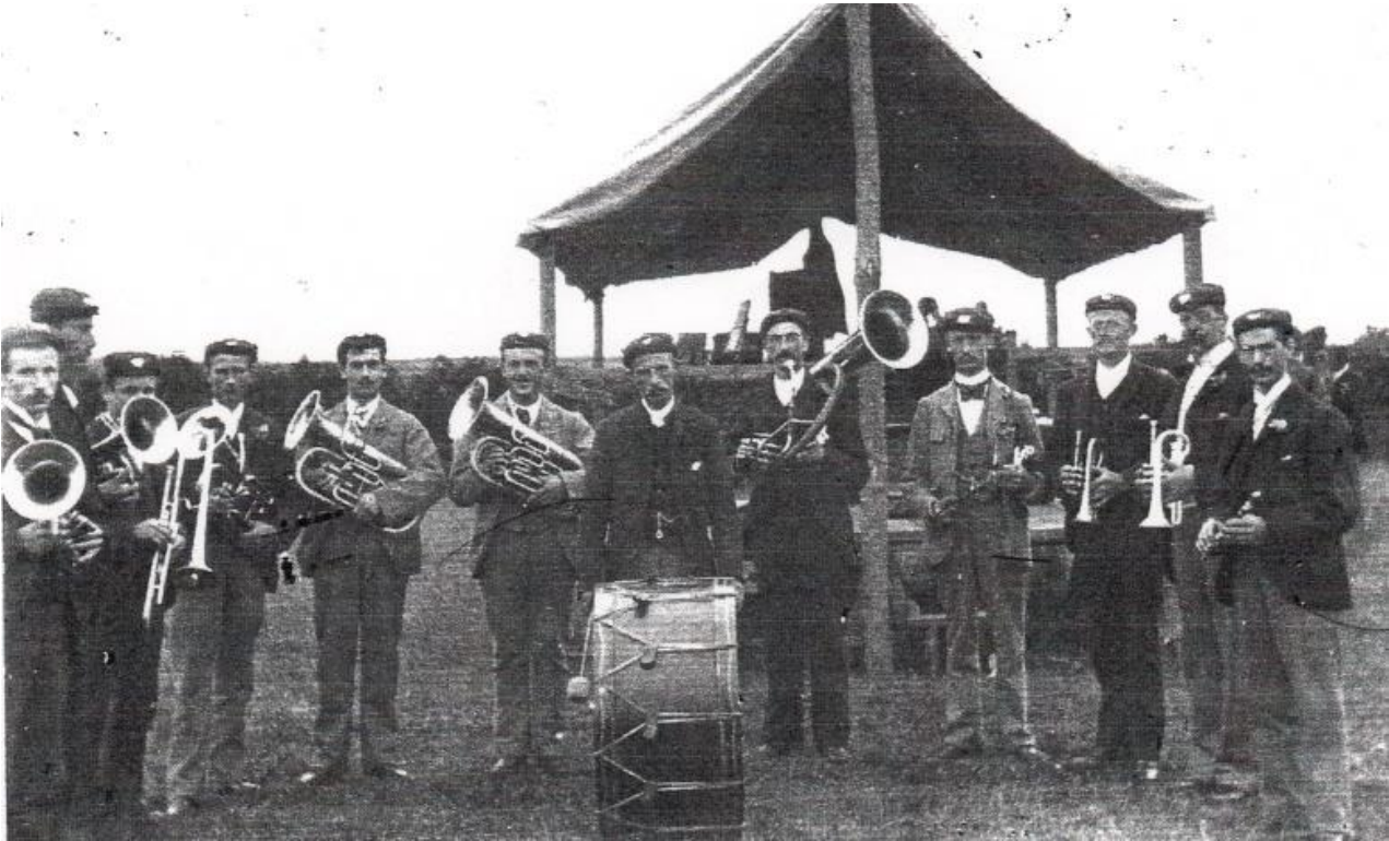
Above and below: Kilhampton Village Band circa 1900 (Photos from Ivor Potter's scrapbook / courtesy of Audrey Aylmer)

1897: Kilhampton Brass Band active and playing in the North Cornwall area. (John Brush)