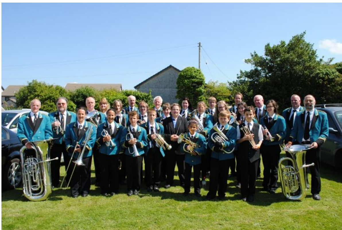
Liskeard Band at Bugle Contest 2014