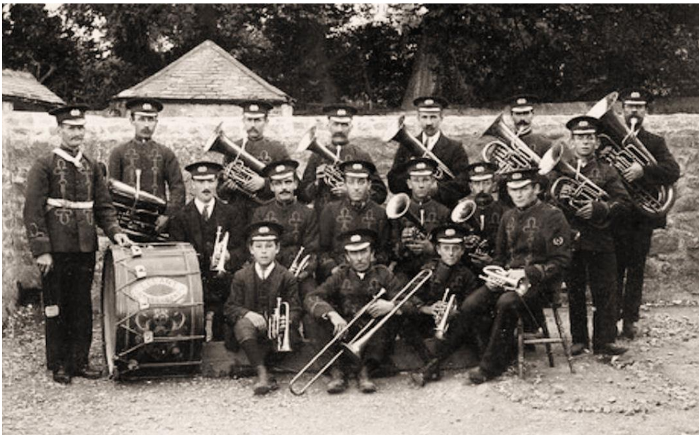
Lelant and District Band date unknown

1944: "As the weather was fine a parade assembled at the lodge gates and proceeded to church headed by the newly-formed Lelant and District Band under Bandmaster Coombes..." (16 November 1944 – Cornishman)