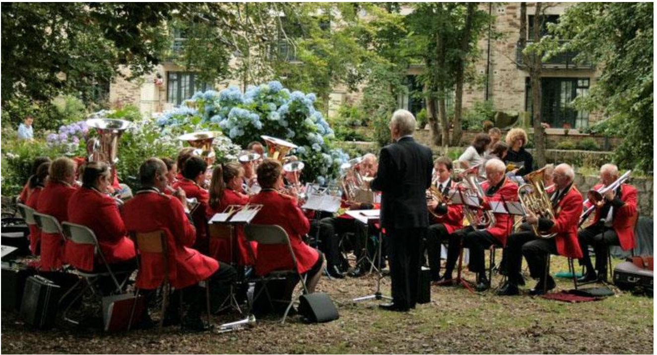
Lostwithiel Silver Band