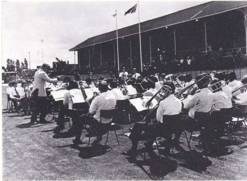
The Cheshire County Youth Brass Band (1973)

As Head of Instrumental Tuition for Cheshire Education he has been responsible for the growth of district bands and orchestras as well as teaching brass instruments in primary and secondary schools.