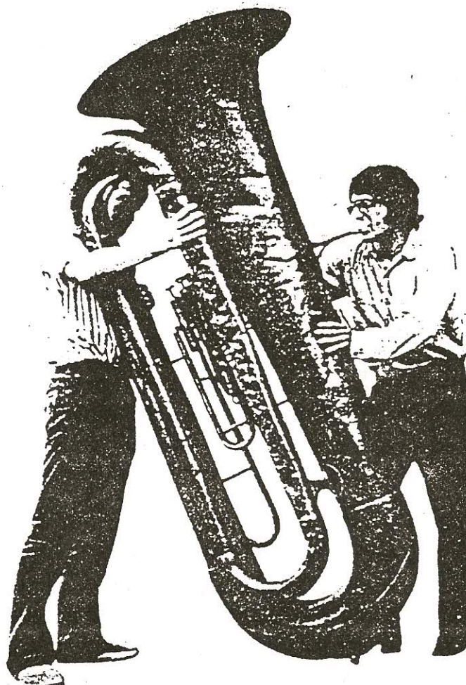
Tuba built for JP Sousa

Our trip this year to West Germany was a great success. We played a number of concerts in various locations in and around Bad Hersfeld, including our first concert in the DDR at Bad Salzungen. Our friends from the Sport & Musikverein hosted us very well. We broke our return journey at Bocholt on the Dutch border, where we enjoyed the hospitality of the town and its people, playing two concerts in the town itself. There are no plans yet for future overseas visits or return visits by SMV, but one of the music groups in Bocholt, the BoKaGe Big Band hopes to visit their twin town Rossendale in October next year and to visit Harrogate one day to play a concert.