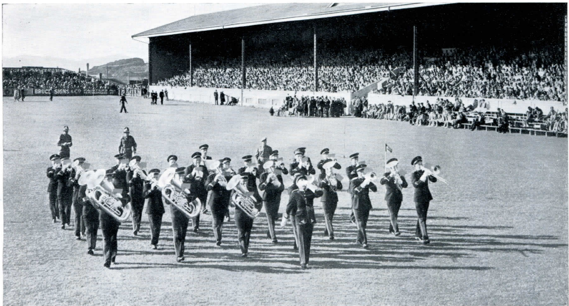
A PROVINCIAL BAND TAKING PART IN A QUICKSTEP CHAMPIONSHIP. ARMY REPRESENTATIVES, SEEN AT THE REAR, ACT AS JUDGES OF MARCHING.