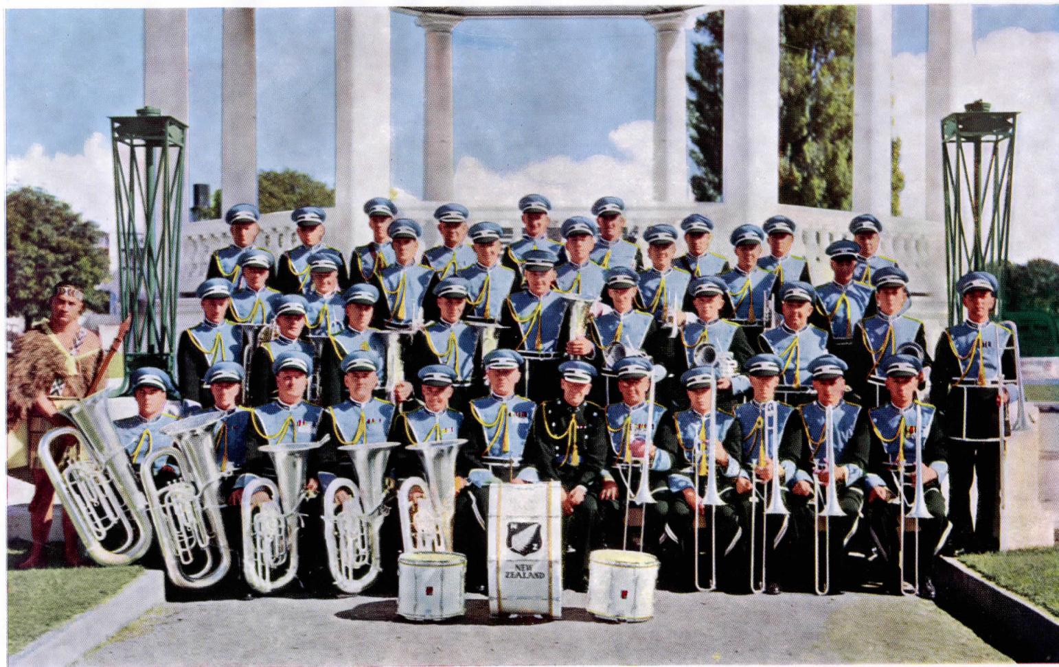
THE NATIONAL BAND OF NEW ZEALAND