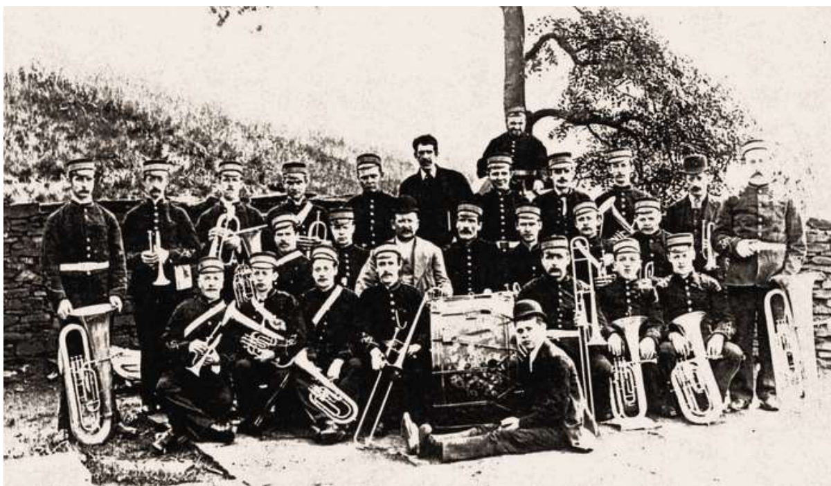
Goodshaw Band, 1893

Having spent the winter in practising these and other pieces and the spring coming round, this was a very humorous task, that was learning to march. To practice they went on to the hills, there being a pretty level field which is known by the name of the Lots, which is on the road leading from Love Clough to Accrington. And by going across the field and back a few times their lips soon began to give way, they not being used to playing and marching, and on retiring came into the village and agreed to play in for the first time which was quite amusing, some getting across the bridge a yard or so in front of the others, and not being able to play to their headquarters had to make a circle besides the well, the road leading up to the band room being rough and steep, and which all the old villagers used to call it Up Nook, and it was a nook and is yet their band room having been an old coach house, but they did not stay there very long for they removed to the bottom room of the western part of the old Mansion House, being part of one I have mentioned before, the top room being used as a Wesleyan school and chapel, and while having this room they got on very well as far as playing was concerned and they commenced getting engagements.