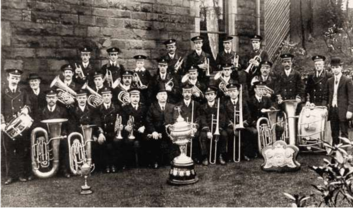
Goodshaw Brass Band, 1912

they were all getting a good lunch and preparing for home, who should come but some of the Accrington Old bandsmen, who gave them a little encouragement to persevere and stick together and, after they had played a piece for them, they made for home, having got rather late and dark and raining, and over that hill to come and played all that sound was no mean task.