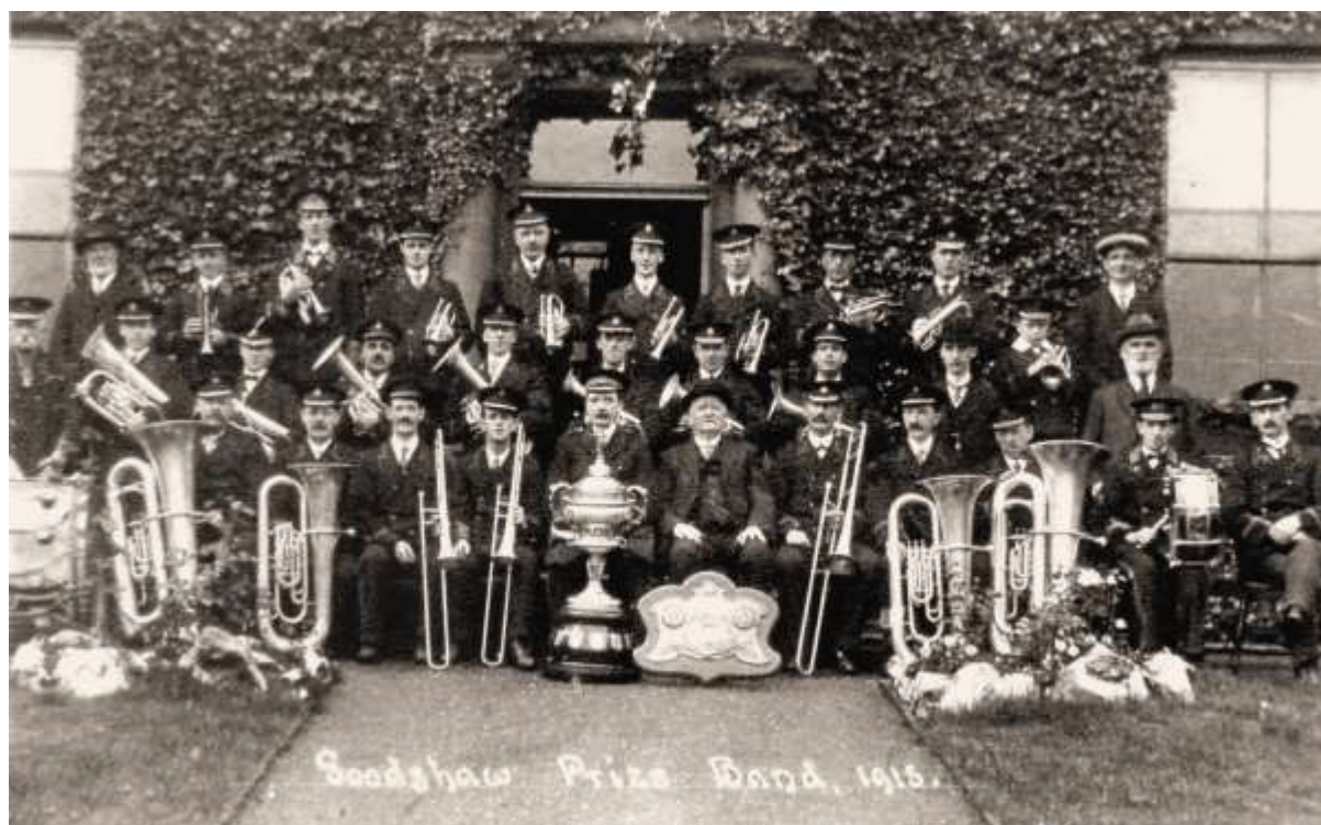
Goodshaw Prize Band, 1915