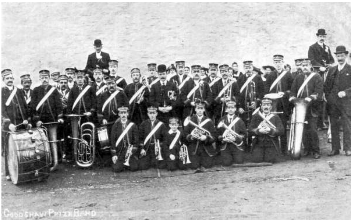
Goodshaw Band, 1904