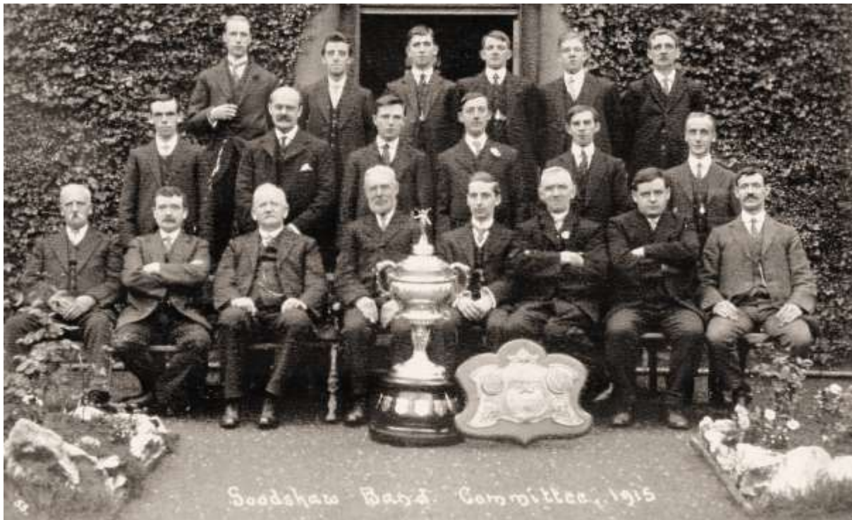
Goodshaw Band Committee, 1915