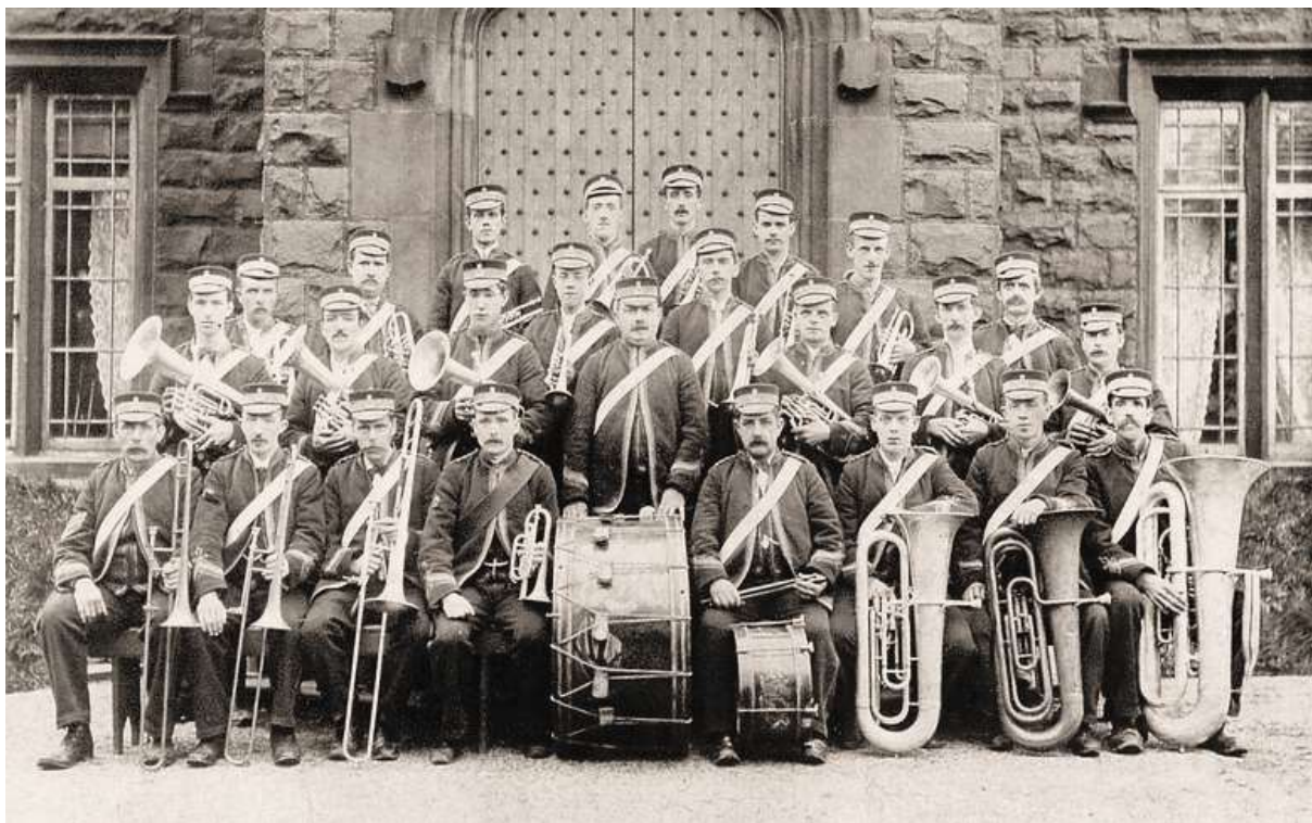
Goodshaw Band, 1903

In introducing the following to its many readers the writer has endeavoured so far as possible and to the best of his ability to meet the requirements and expressed desires of hundreds of true lovers of music amongst both the classes and the masses throughout the whole district and county. It is no easy task to bring all things from memory, but what with interviews with old and aged members, and much having been derived from direct personal experience, compiling and chronicling events and incidents for years past, yet nevertheless we have the gratification of being able to place before the public a reading calculated is in every subject to be interesting and undoubtedly useful to its several admirers. For a sequel to the Origin and success of the Goodshaw Band having become loud and importunate to be resisted, the pleasant task of writing it is purely and simply one of love, therefore should it prove the humble instrument of transposing into the minds of any organisation and may some portion of that sublime spirit of emulation which glows in the heroes of our text, and in the memories of the old members who are still living, and yet having a remembrance of those who have passed away, the writer will consider himself abundantly compensated for his task.