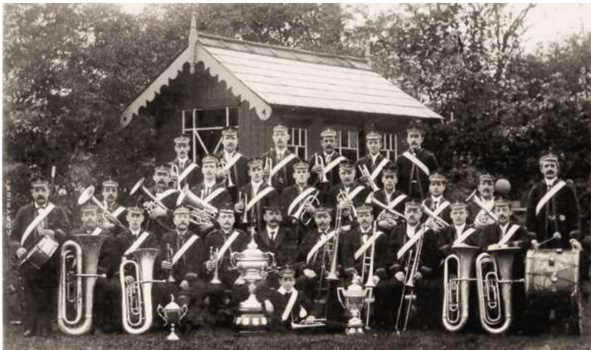
Goodshaw Brass Band, 1906