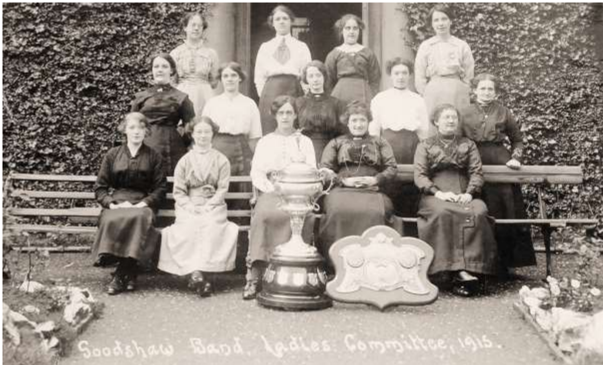
Goodshaw Band Ladies Committee, 1915