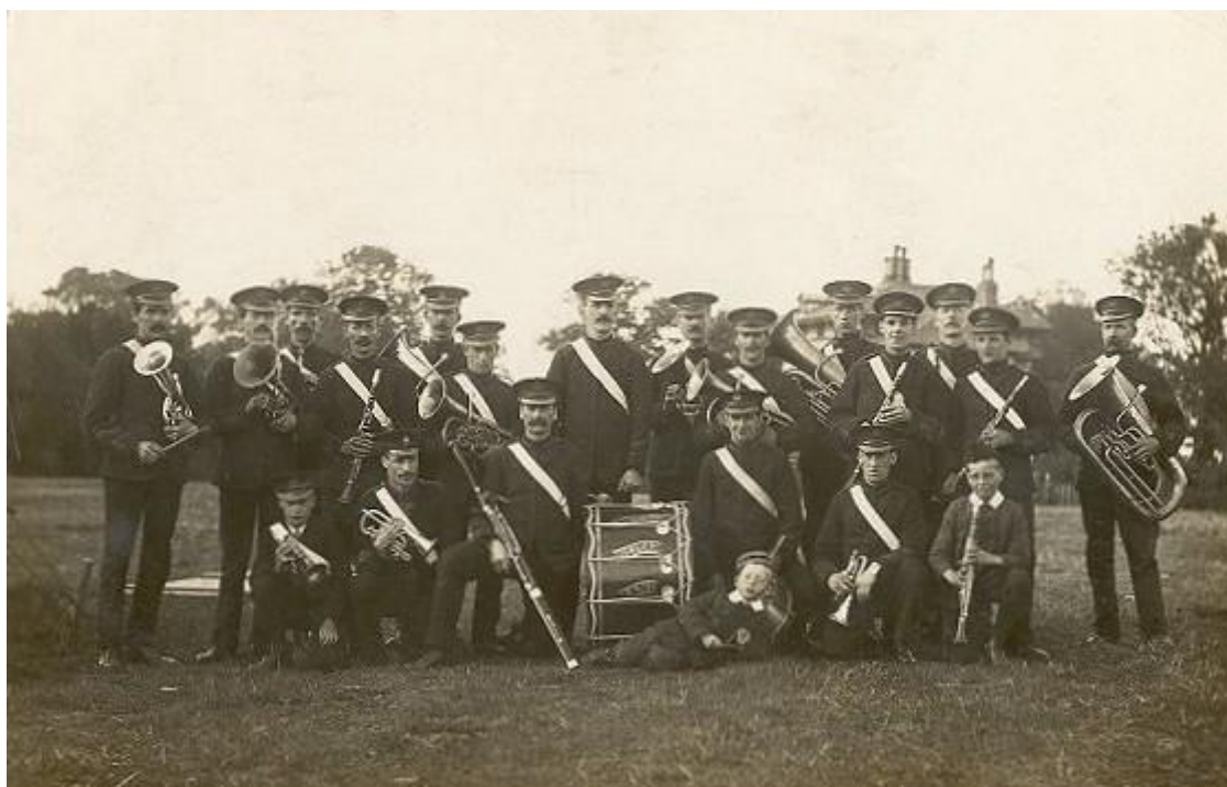
Mansfield Military Band, 1913