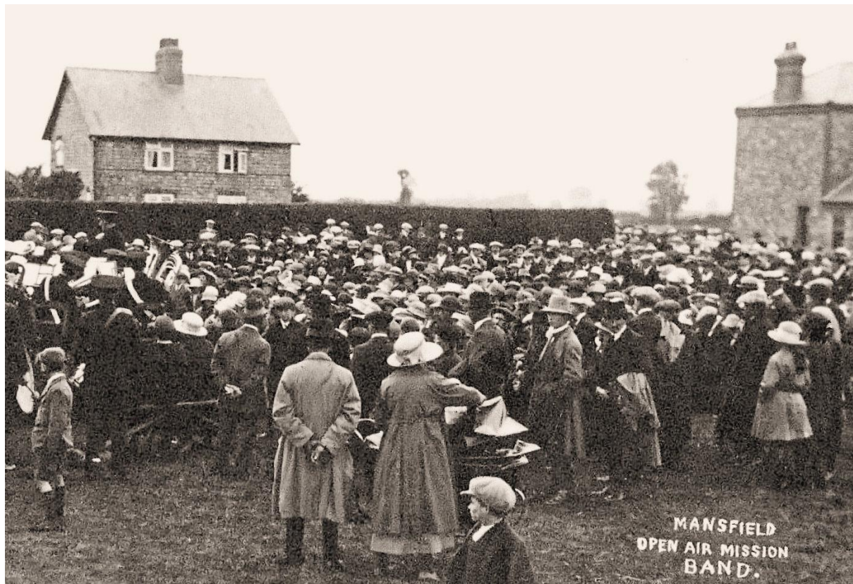
The Band playing at an open-air demonstration, c.1922

There is no mention of the Band after 1936, so it is assumed that it disbanded soon thereafter, and certainly did not survive WW2.