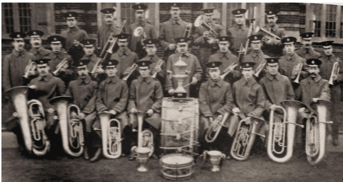
Mansfield Colliery Brass Band