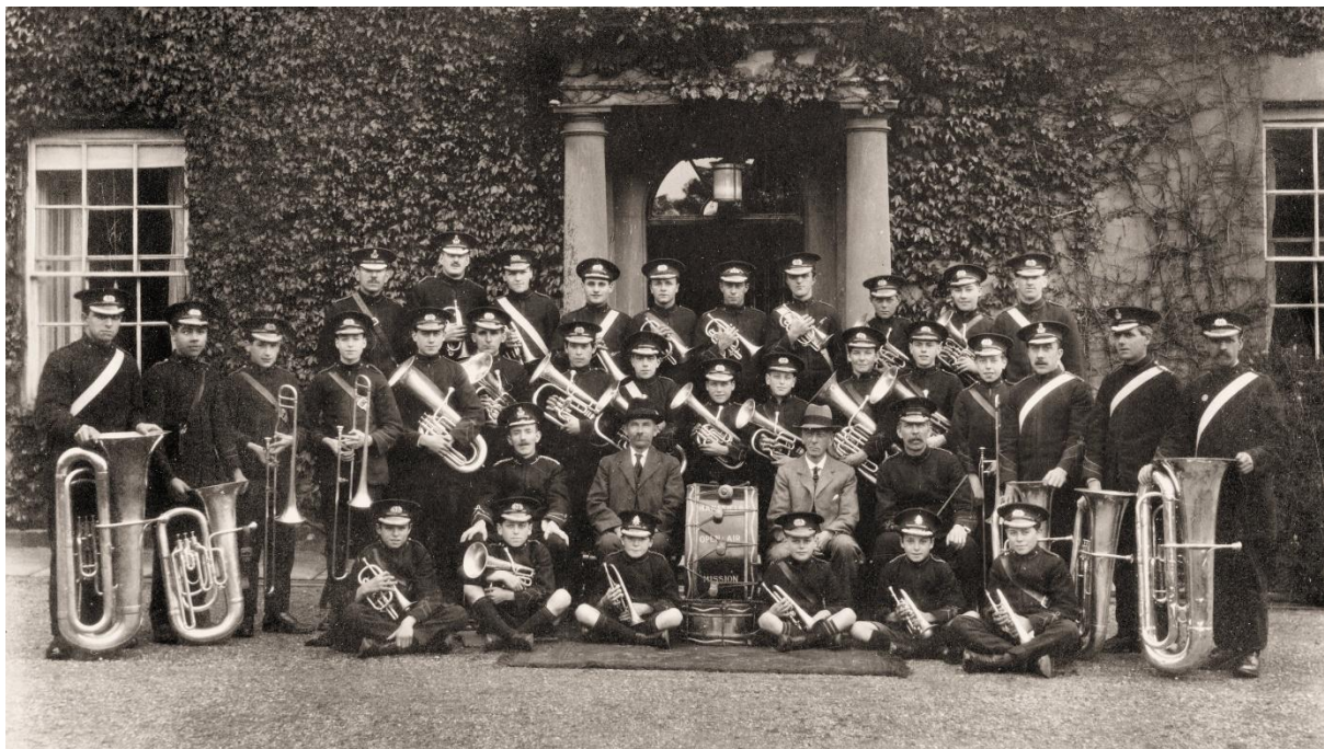
Members of the Band (above) in 1923:

The Band supported the local Methodist churches and raised funds for various good works in the district, particularly support the childrens' and hospital funds.