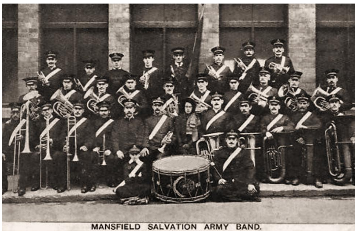
MANSFIELD SALVATION ARMY BAND.