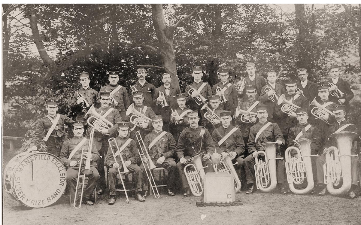
Mansfield Excelsior Silver Prize Band