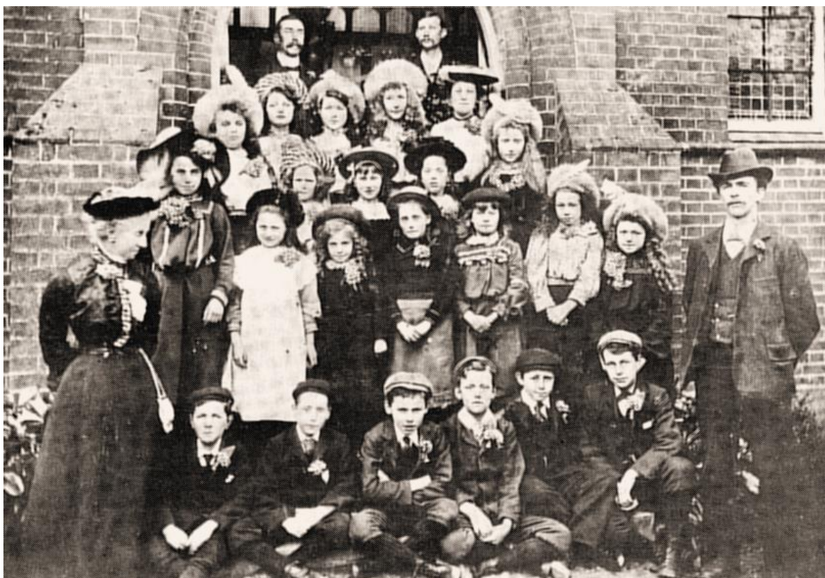
Members of Hassocks Congregational Church