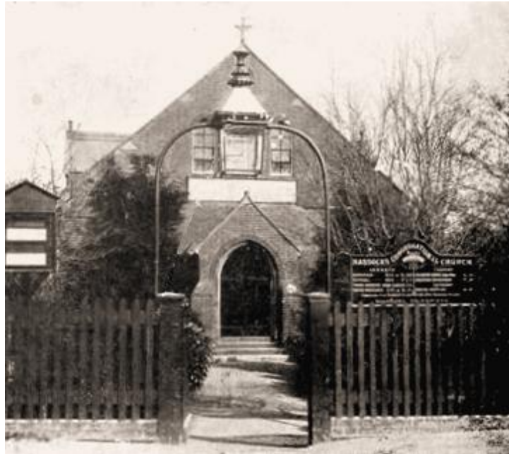
Hassocks Congregational Church