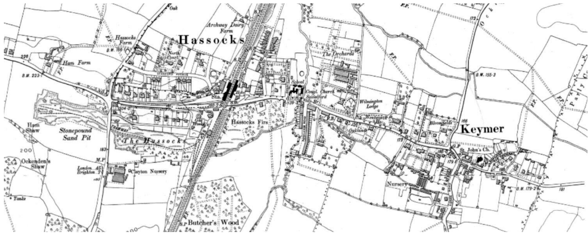
Hassocks & Keymer villages, c. 1910