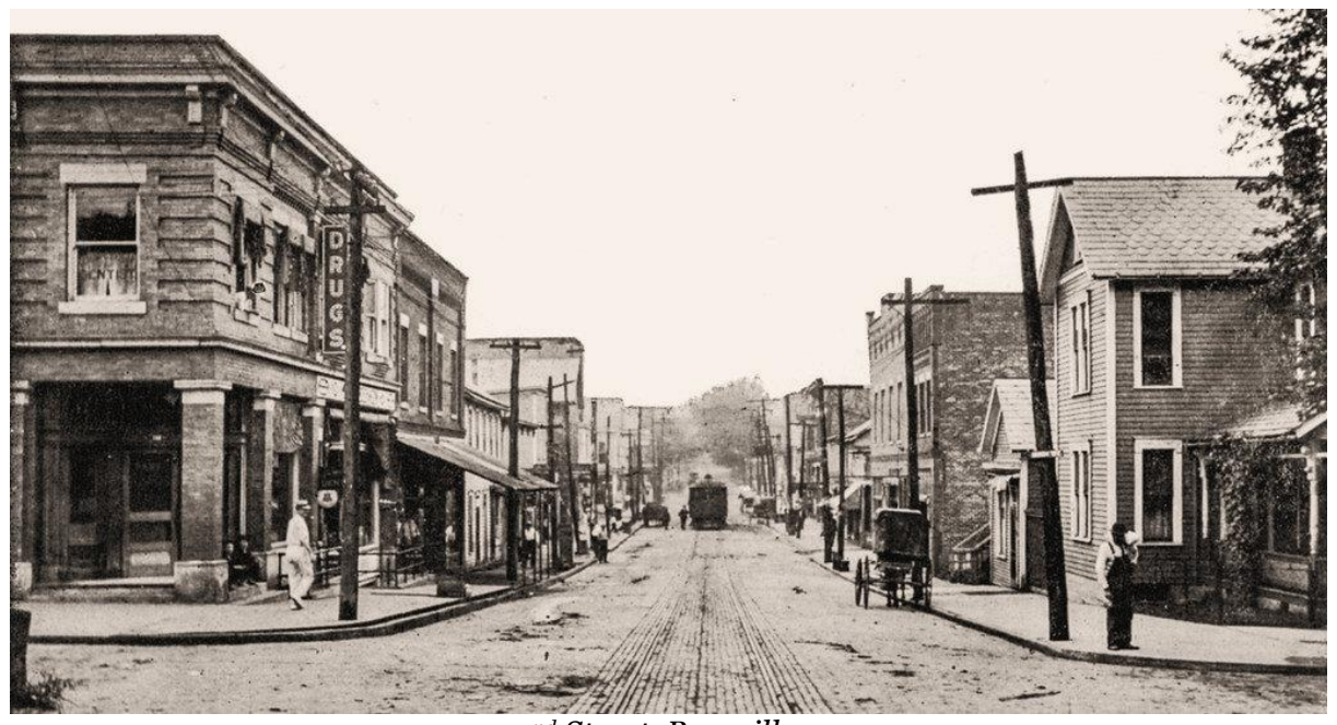
2<sup>nd</sup> Street, Byesville, c. 1905