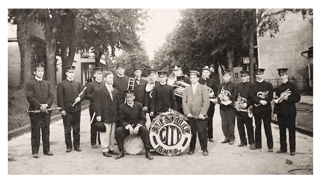
The Band gave a free open-air concert on Tuesday 17 June 1913.3

This next photograph shows the Byesville City Band a little later. They have their name fully blazoned on the drum.