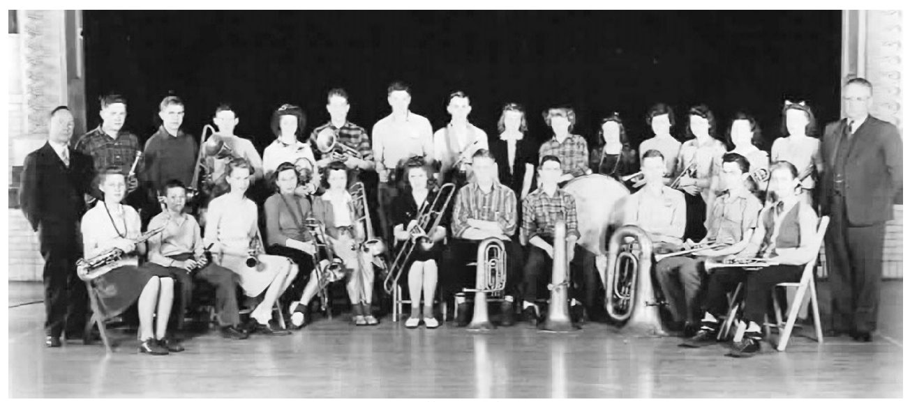
Byesville Band, 1943

There was also a Byesville Junior Band, though no further details about it are known, other than this photograph.