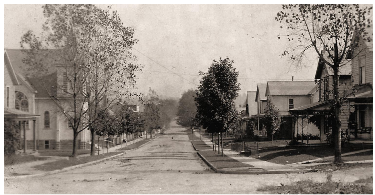
West Main Street, Byesville, c. 1910

This next photograph shows the Byesville City Band a little later. They have their name fully blazoned on the drum.