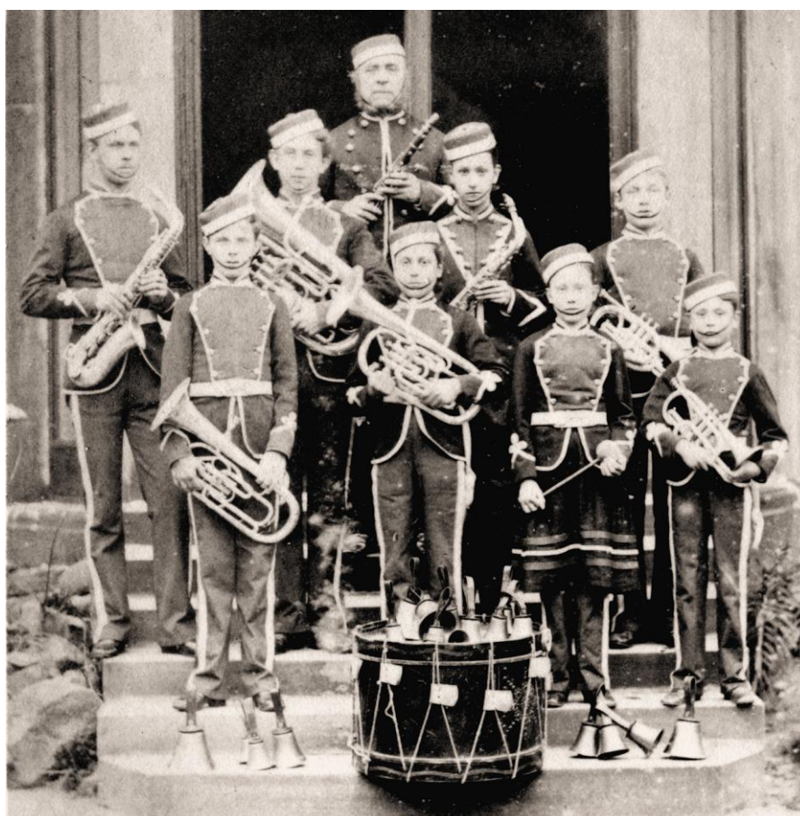
Tyler Family Silver Band, c. 1875

On Wednesday 26 th July their evening concert was relayed to telephone subscribers and their friends in Dewsbury. This telephone broadcast was repeated on Thursday and Friday evenings, even though the Thursday evening suffered a 'strong earth current', with the playing of the soloists to the finest note, their most elaborate double-tonguing or fingering being easily heard, and so could the applause of the audience, down to the last clap of the hands. On lady, commenting on the Wednesday performance, said she could 'hear the interval' – a somewhat paradoxical and surprising statement – what she meant was that she could hear the buzz of conversation during the interval.