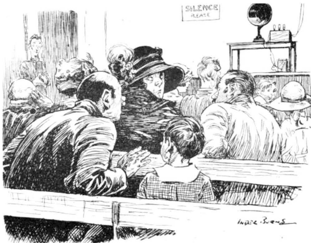
OUR WIRELESS VILLAGE CONCERT. Mr. A. Lotment: "Would you kindly remove your hat, Madam?"

The transmission was made using a 1.5 kW transmitter. To listen to the radio you needed a licence, which cost 10 shillings. The audience was small to begin with – just 30,000 receiver licences had been taken out across the UK up to that time. However, by the end of 1923, some 250,000 had been purchased, with possibly as many listeners again receiving the broadcasts on unlicensed equipment.