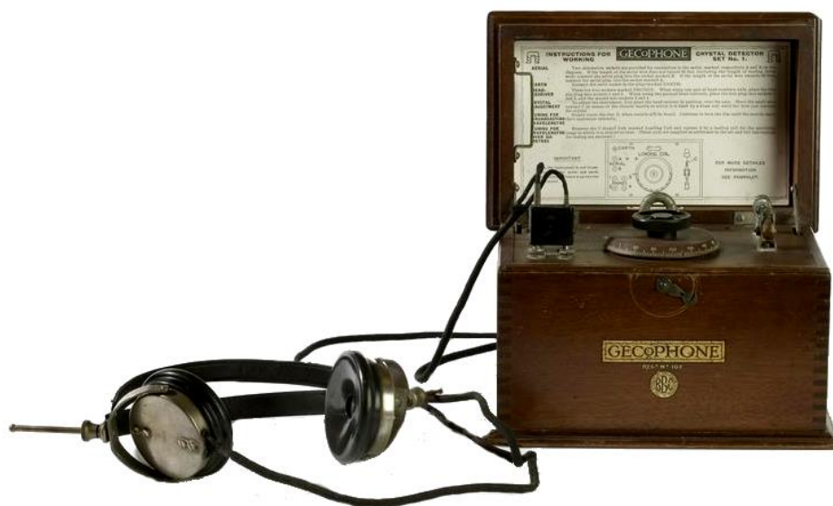
GECophone radio crystal detector set, c. 1925