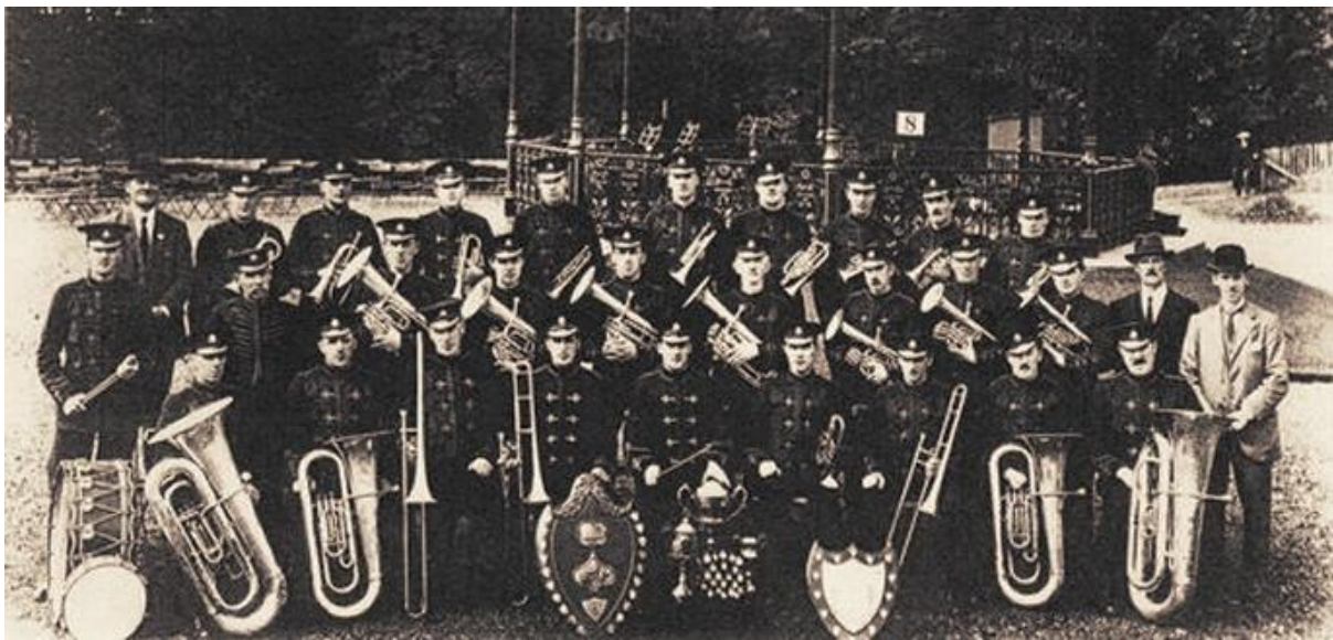
Clydebank Burgh Band in 1922