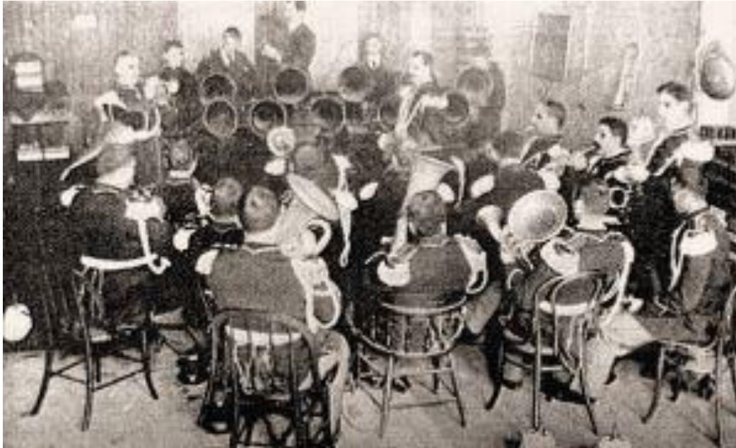
A band recording on the phonograph

“The most remarkable was the perfect and effective reproduction of the Silsden Brass Band, recorded in Yorkshire.”